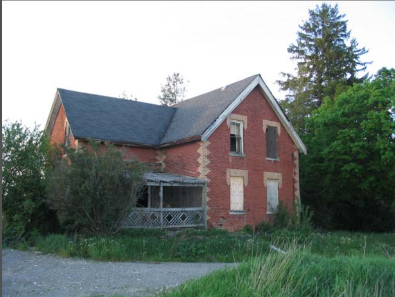
11178 Kipling Avenue brick farmhouse, deteriorated