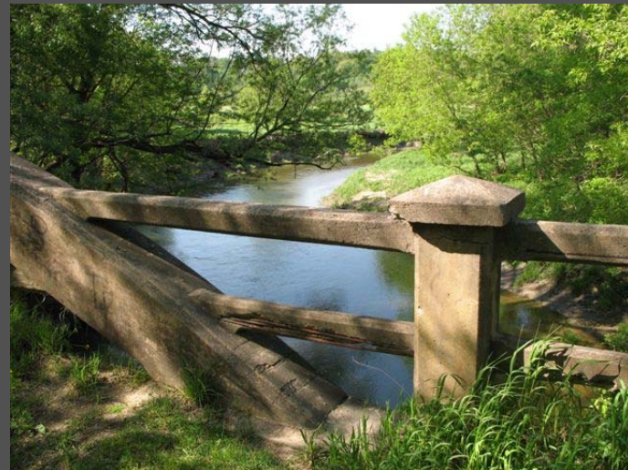
Humber River valley east of Huntington Road, with bowstring bridge