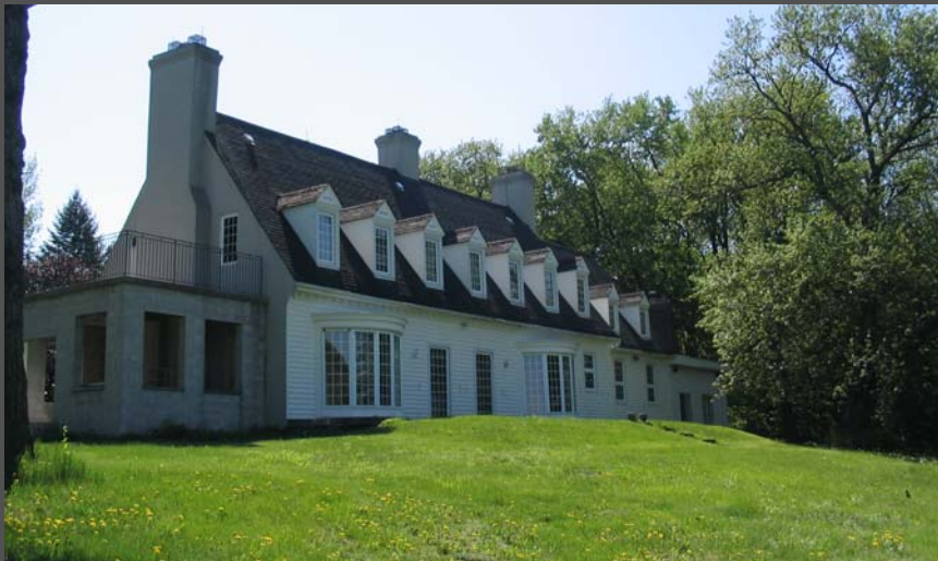
Huntington Road stud farm “summer house”