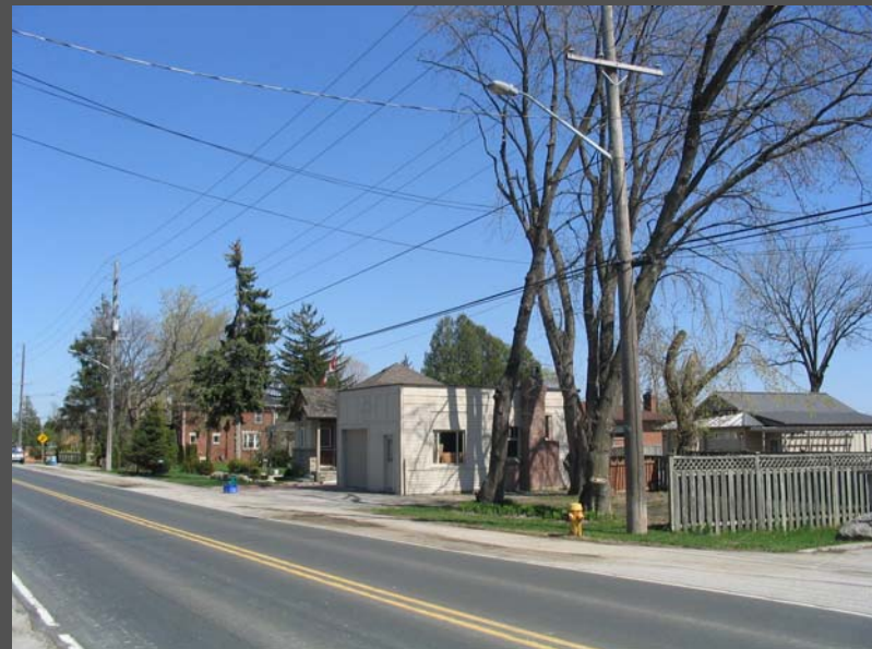
Nashville main street, south side