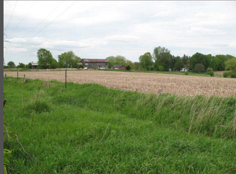
Kipling Avenue farm complex