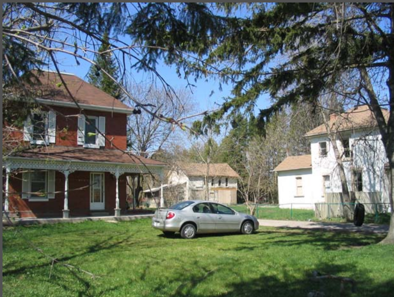
Nashville main street, north side