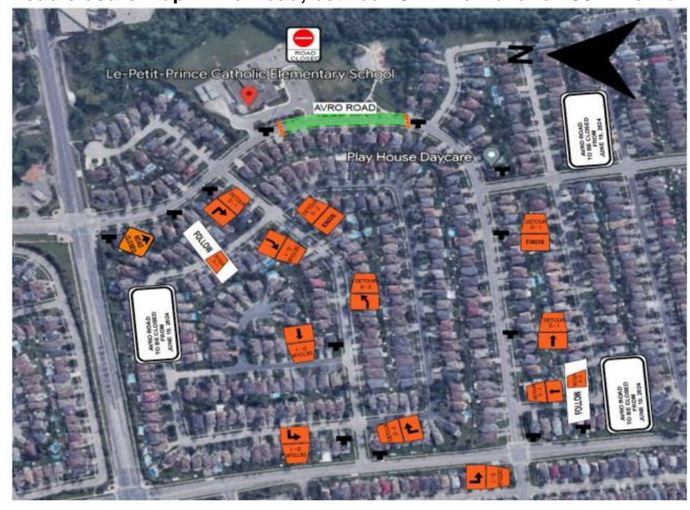
Road closure map: Avro Road, between 84 Avro Rd. and 136 Avro Rd.