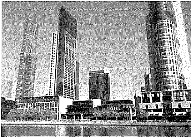
Crown Casino and Hotel Complex on Yarra River, Melbourne