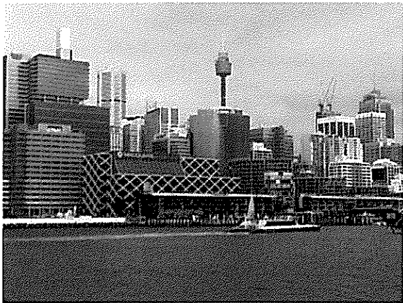
Darling Harbour, Sydney