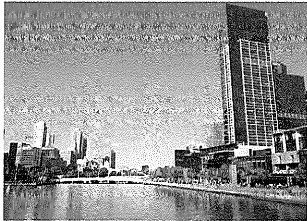
Crown Casino on Yarra River Waterfront Promenade, Melbourne