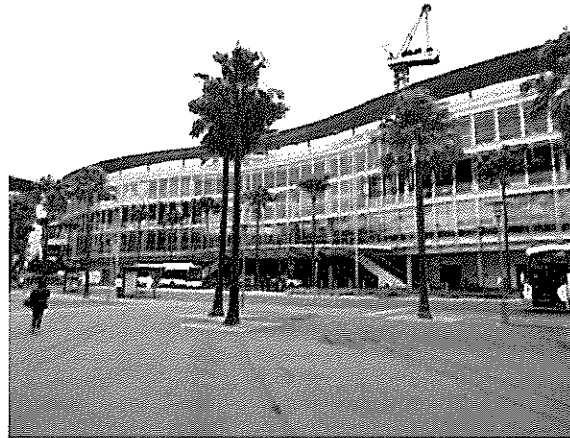
Star Casino Complex Darling Harbour, Sydney