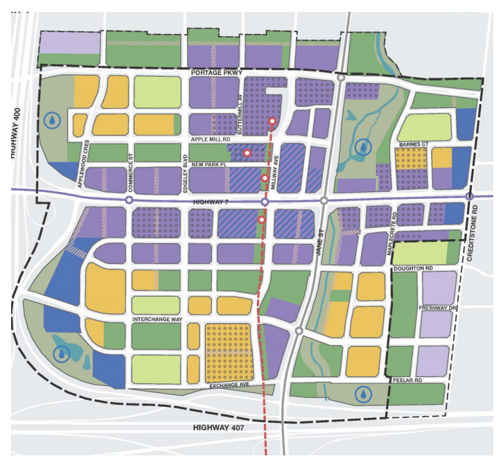
Figure 2: Option 1 Land Use