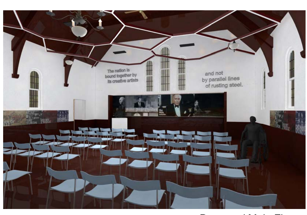
Proposed Main Floor