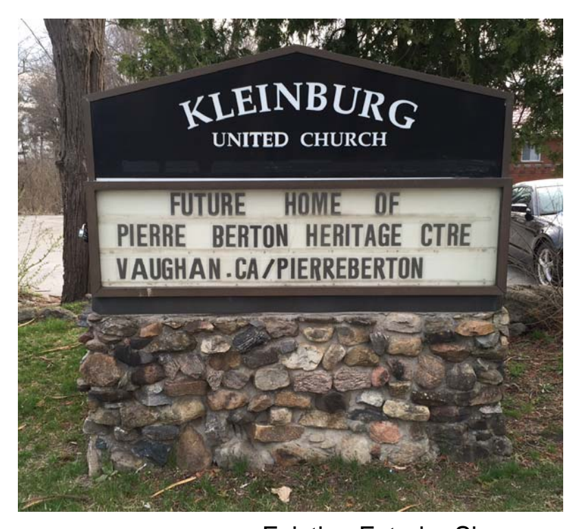
Existing Exterior Signage