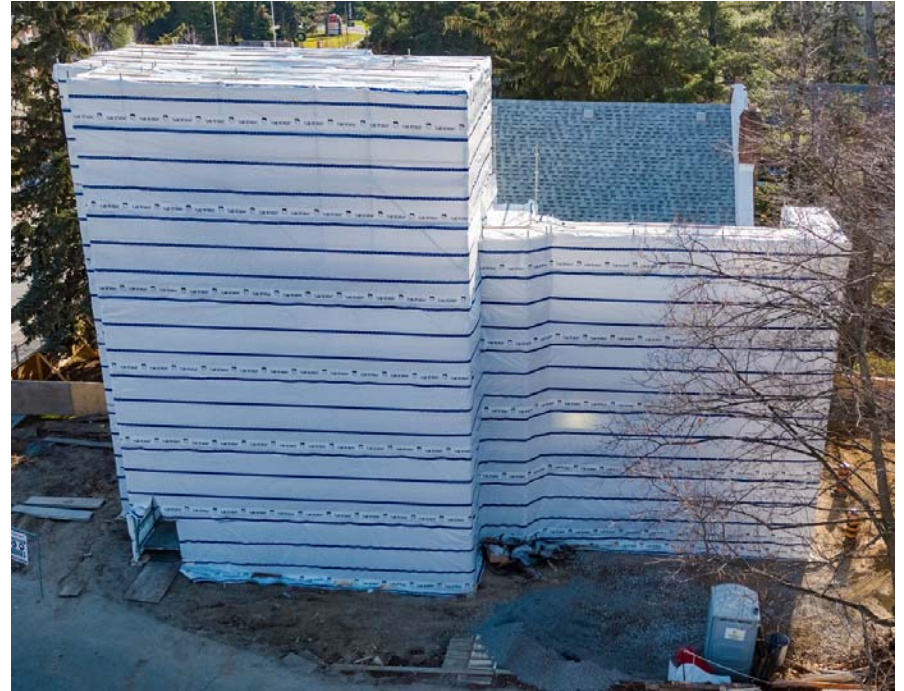
North Elevation Tarping