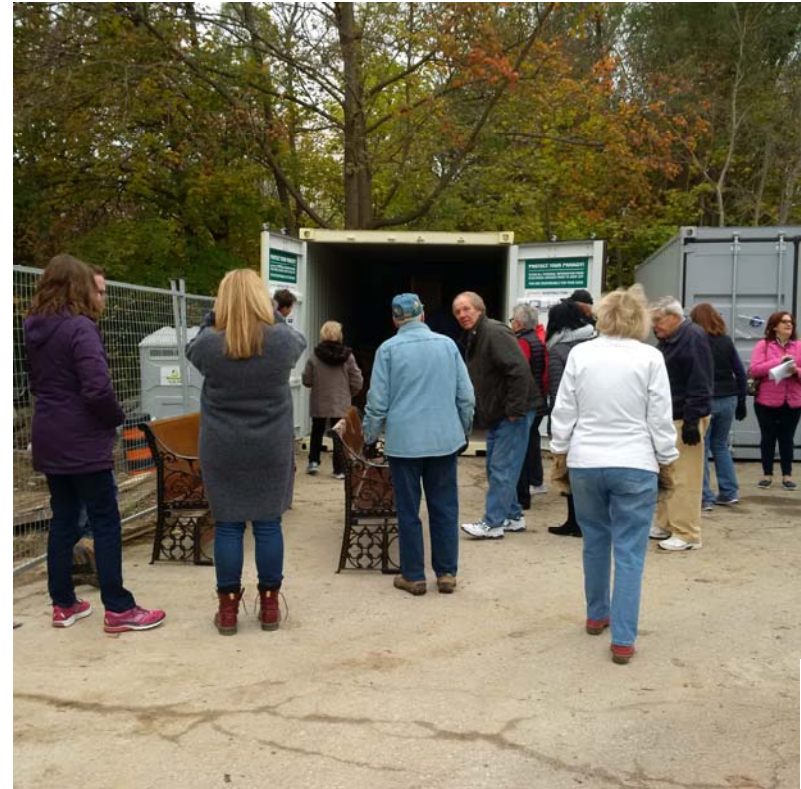
Public Offering of Church Pews on November 4, 2017