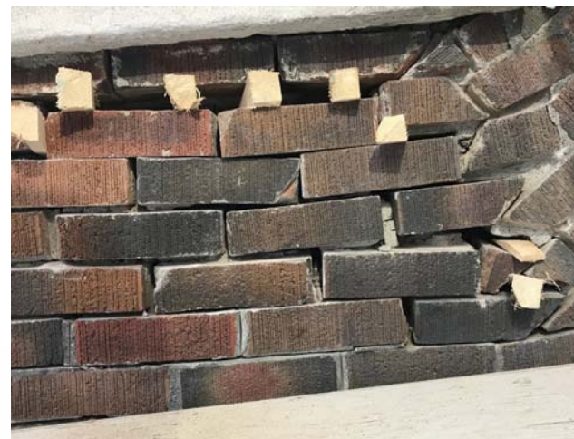
Additional Masonry Repair