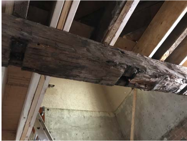
Wood Beam Replacement