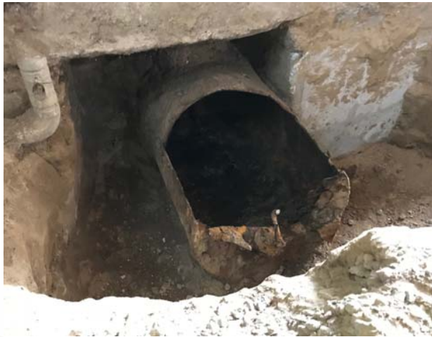
Buried Oil Tank (Interior)