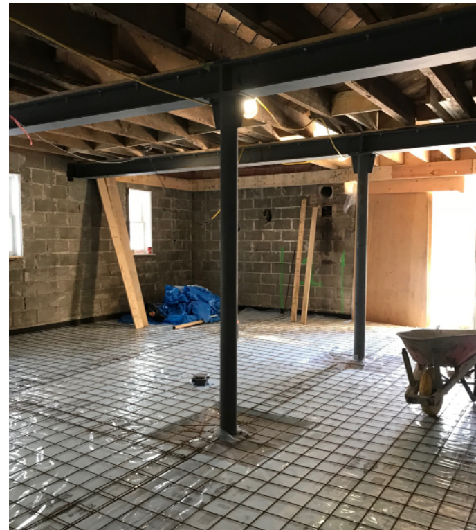
Basement During Construction