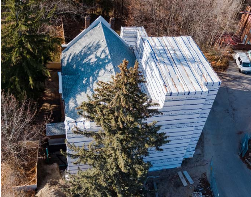
East Elevation Tarping