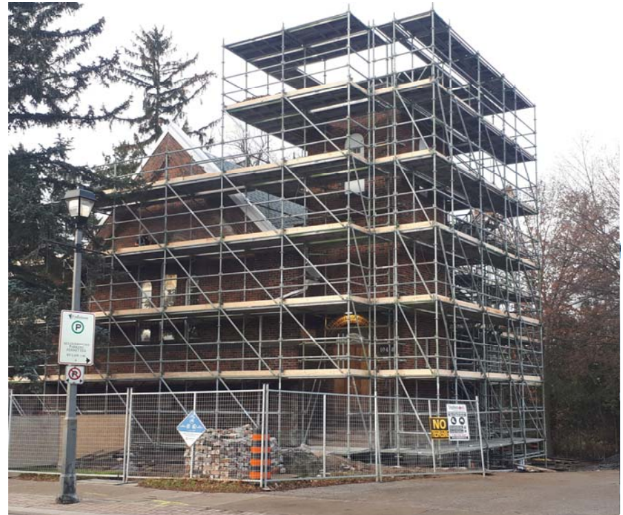
Exterior Scaffolding (December 2017)