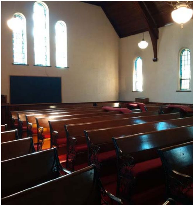
Existing Main Floor