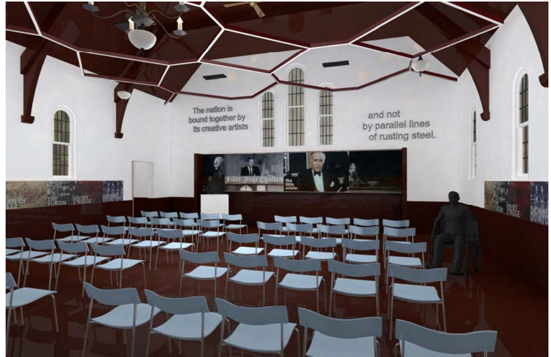
Proposed Main Floor