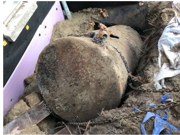
Buried Oil Tank (Exterior)