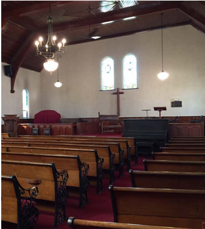
Main Floor Before