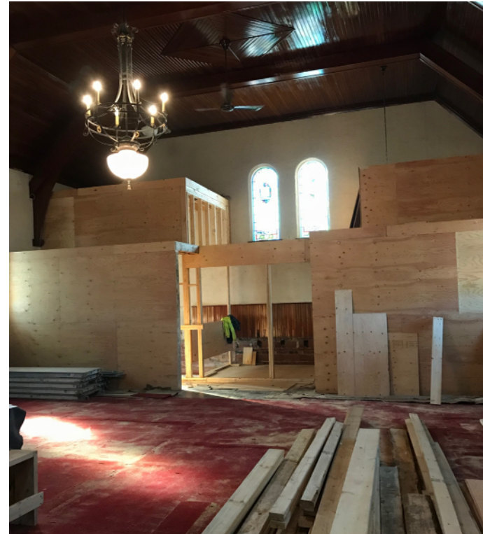
Main Floor During Construction