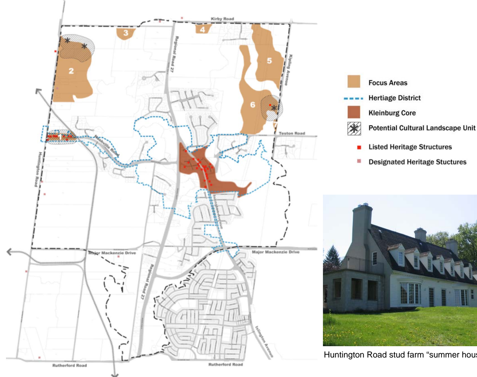
Huntington Road stud farm "summer house"

Kleinburg-Nashville Community Plan | local heritage context