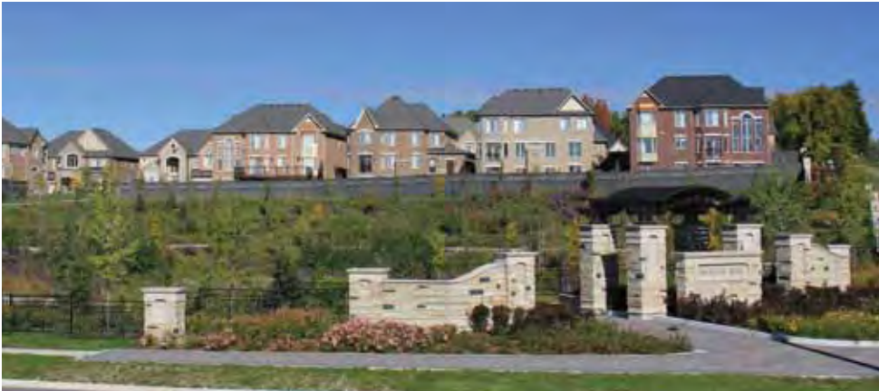
OWNER / DEVELOPER: Ventana Homes Inc. DESIGN TEAM: Cosburn Nauboris Limited Landscape Architects

Mackenzie Ridge is a planned low density urban residential community with primary access from Dufferin Street. The design team considered all aspects of architecture, engineering, landscape architecture and environmental planning and worked with the Toronto and Region Conservation Authority (TRCA) and the City to establish the development limits. The design involved the provision of buffer zones to the west that were enhanced with native trees and shrub plantings. The placement of the pond at the entrance of the community is a deliberate effort to encourage both the local and surrounding communities to utilize the public space. A plaza with seating area was developed to complement the stormwater management pond. Together, these form a considerable gathering and open space area with internal walkways that lead users to the pond, plaza and public transit connections. Landscape elements such as the use of vertical wood and steel elements along with masonry, street lights and mixed buffer plantings aided in achieving a dramatic and unmistakable community presence. The jury applauded the project for its sustainability features including native planting and the stormwater management pond as a community amenity. The stormwater management pond with the hardscape and urban elements creates a well-defined gateway.