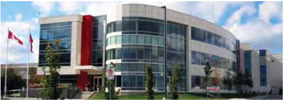
OWNER / DEVELOPER: Longo Brothers Fruit Market DESIGN TEAM: Gross Kaplin Coviensky Architects Terraplan Landscape Architects

of runoff to the municipal storm water system. Drought resistant species are planted eliminating the need for irrigation. The jury agreed that this building was worthy of recognition for its state-of-the-art design and sustainable features. It felt that the building was outstanding for its innovation and creativity to execution and was an exemplary building for other employment areas.