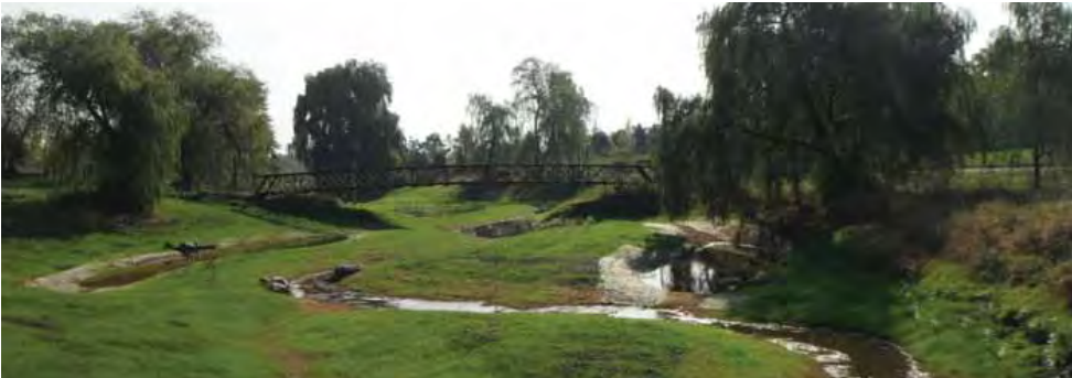
OWNER / DEVELOPER: Castlepoint Investments Inc. DESIGN TEAM: SCS Consulting Group Beacon Environmental Aqualogic, Aboud & Associates Inc.

Castlepoint Investments facilitated the redevelopment of the Kleinburg Golf Club into a residential community. Working with the TRCA and the City of Vaughan, the natural watercourse, modified by the golf club, was re-established to create an on-line pond to provide a supplementary water source for irrigation. Other project goals were to enhance the aquatic habitat and provide for future fish passage within the re-established tributary of the Humber River, to enhance the valley lands by augmenting the tributary with habitat for a variety of aquatic, amphibian, and breeding birds, and to provide for naturalised areas within the community which could be integrated through a pedestrian trail system. The design involved the enhancement of the low flow channel through the addition of secondary side channels, backwater pools, vernal pools, shallow and deep wet meadows, and on-line refuge pools. The existing steel pedestrian bridges, which once spanned the on-line pond, were also preserved and integrated into the wetland channel design to form part of the pedestrian trail system. The jury unanimously agreed that the project demonstrated environmental sustainability through the enhancement and rehabilitation of its habitat. The re-establishment of the on-line pond was a truly remarkable effort in environmental design to reduce impact on the fish habitat through the tributary.