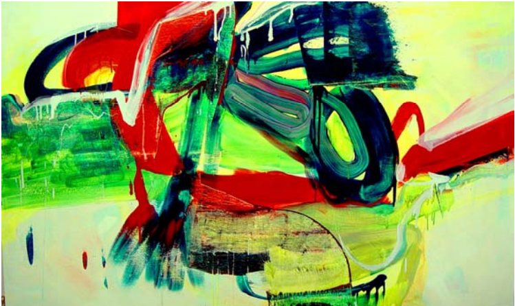
Kaleidoscopic Days 100