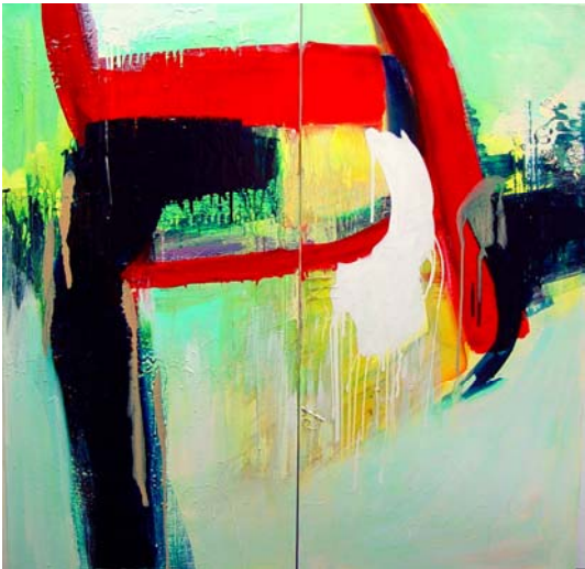
Kaleidoscopic Days 102