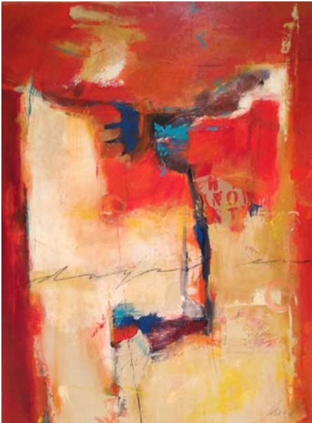
Setting Suns and Desert Moons