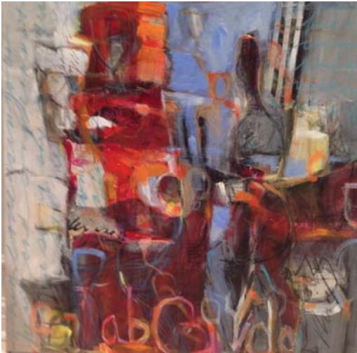
Did You Know? 5