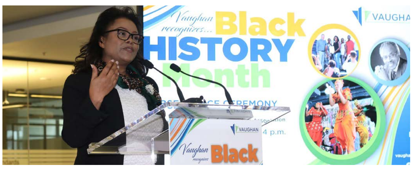
Guest Speaker - City of Vaughan - Black History Month 2019 Event | Emcee of Ceremonies, City of Vaughan - Black History Month 2020 Event

In a press release, the City of Brampton announced that it had appointed the City of Vaughan's Integrity Commissioner as a temporary integrity commissioner from March 1, 2019 to May 31, 2010 as it continued its search for a permanent replacement [of its resigning Integrity Commissioner]. Provincial legislation, which came into effect March 1st, requires all municipalities to have an integrity commissioner in place; the city said: Section 233.3 (1.1) of the Municipal Act states that If a municipality has not appointed a Commissioner, the municipality shall make arrangements for all of the responsibilities set out in the Act to be provided by a Commissioner of another municipality. In order to remain in compliance with the Municipal Act,