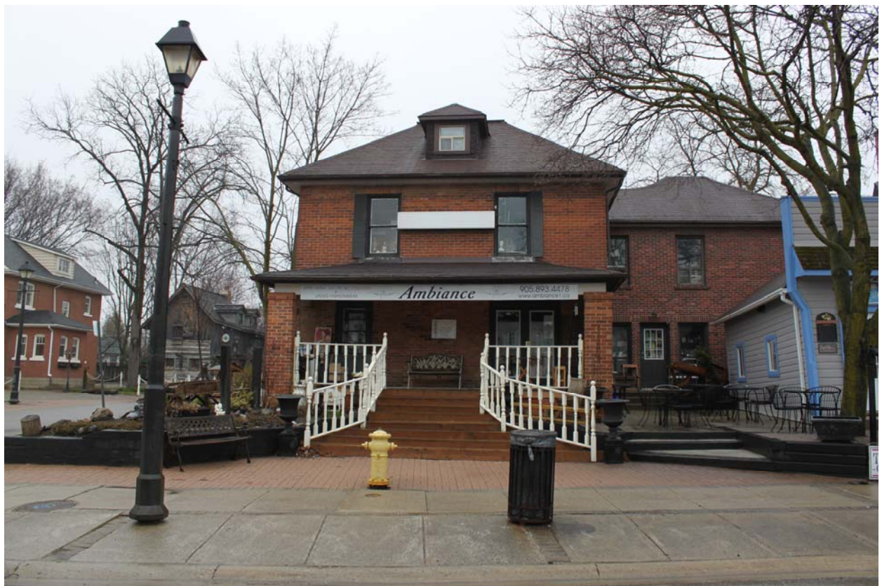
Front elevation. April 2011