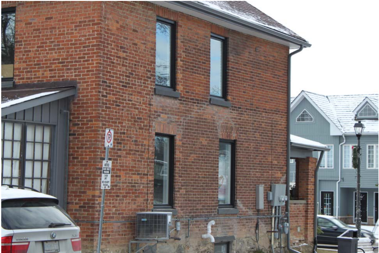
Side elevation. November 27, 2013