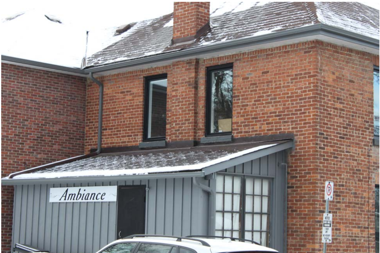
Front and rear elevations. November 27, 2013