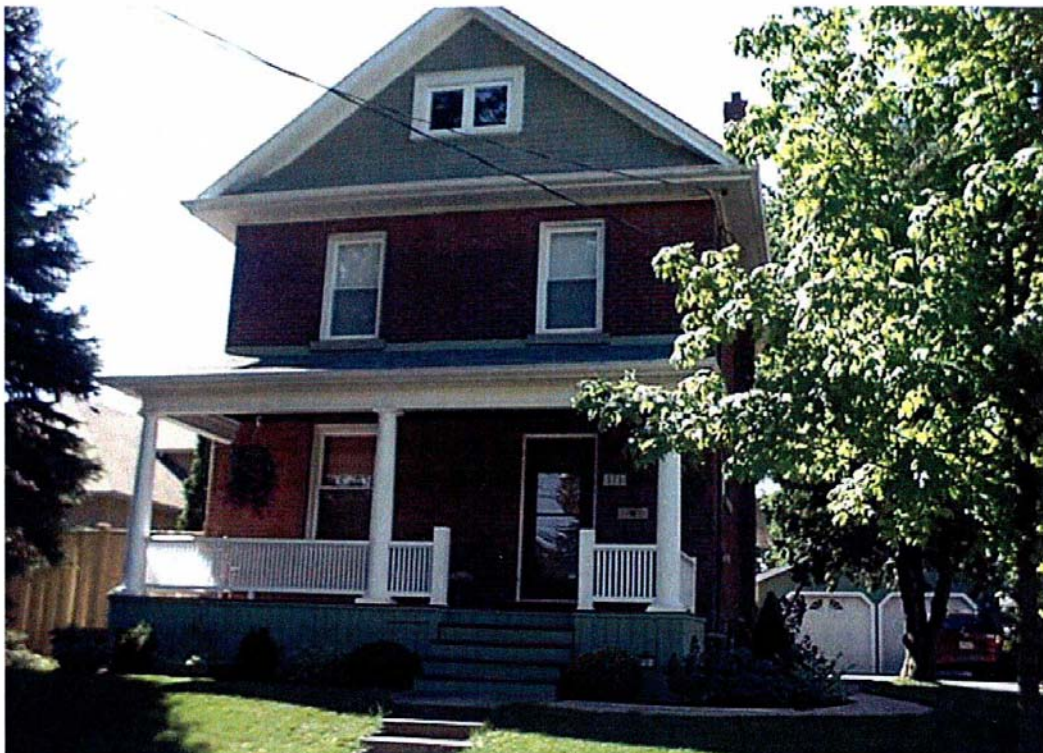
Edwardian home with 1over1 hung windows