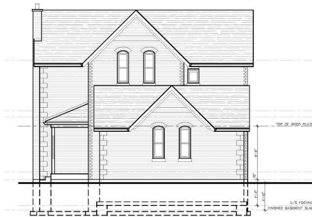
2 PROPOSED EAST ELEVATION A2 SCALE: 1/8" = 1'-0"