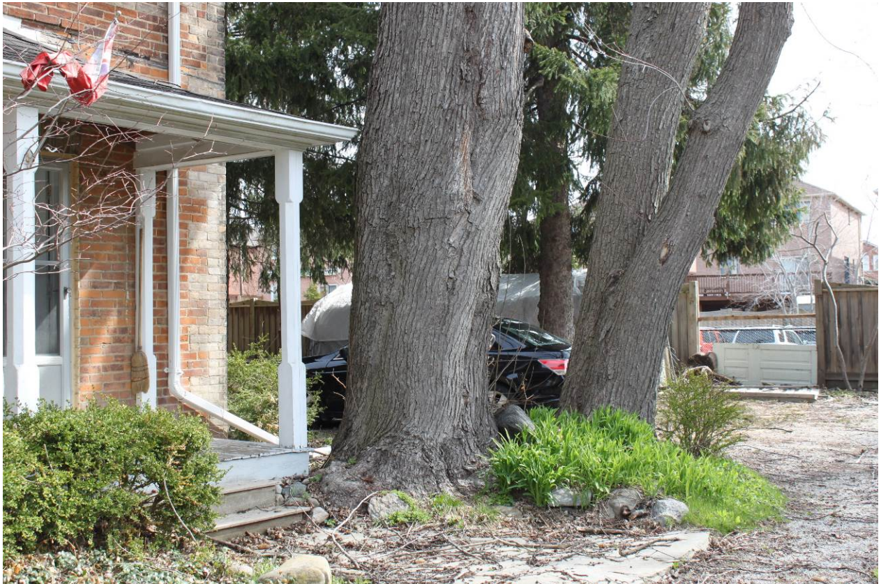
Interior of closed porch and mature trees proposed for removal. May 7, 2014