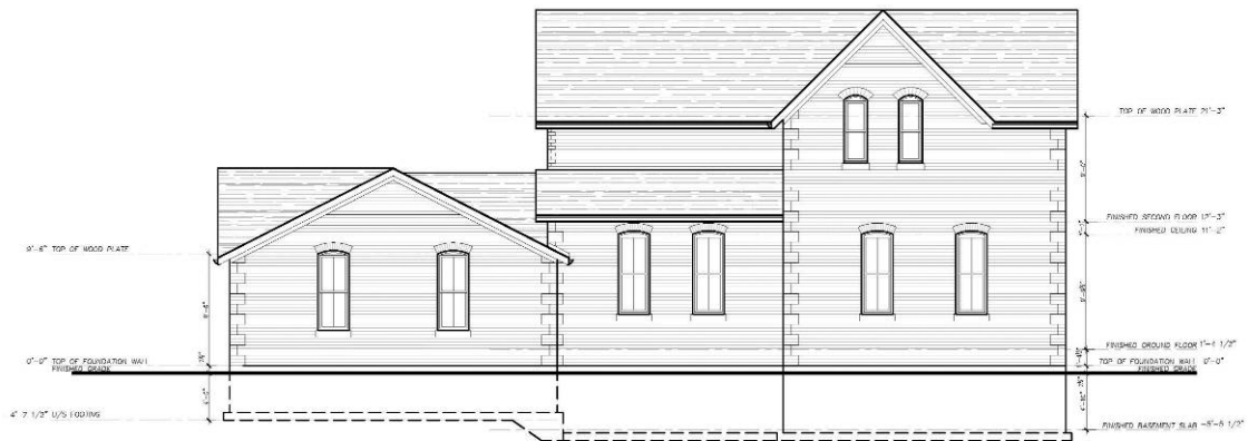
1 PROPOSED NORTH ELEVATION A2 SCALE: 1/8" = 1'-0"