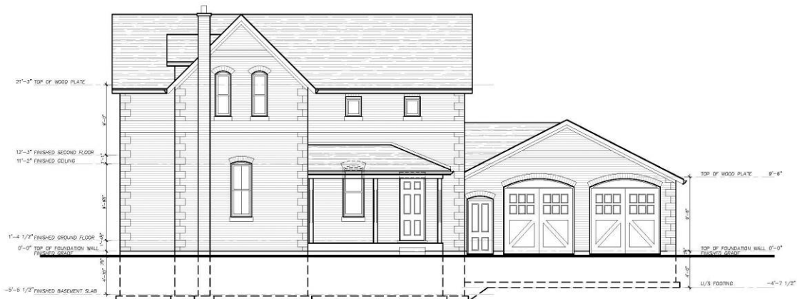
4 PROPOSED SOUTH ELEVATION A2 SCALE: 1/8" = 1'-0"

Proposed east and south elevations. Received May 13, 2014