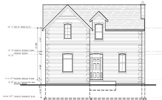
3 PROPOSED WEST ELEVATION A2 SCALE: 1/8" = 1'-0"