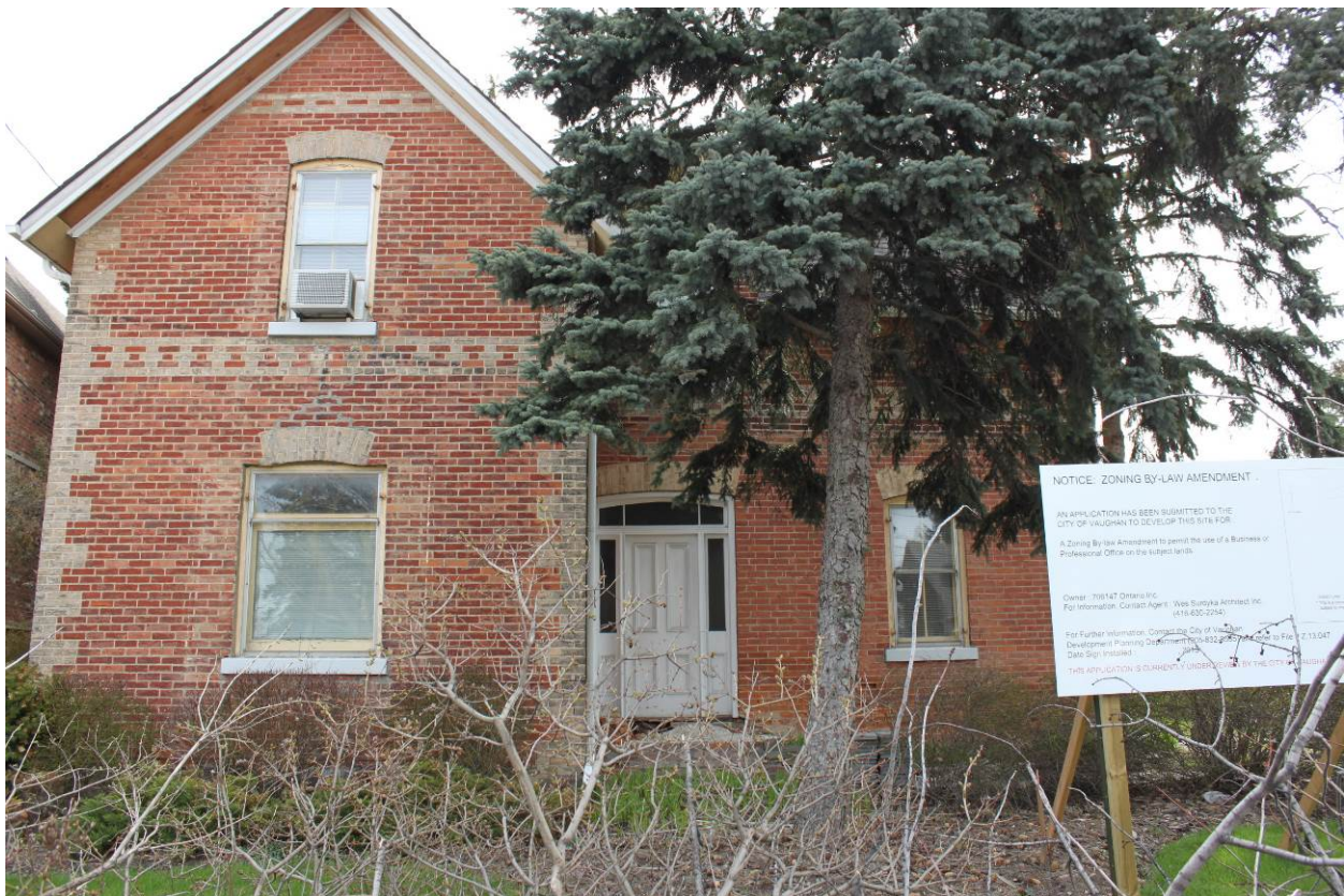
Front elevation. May 7, 2014