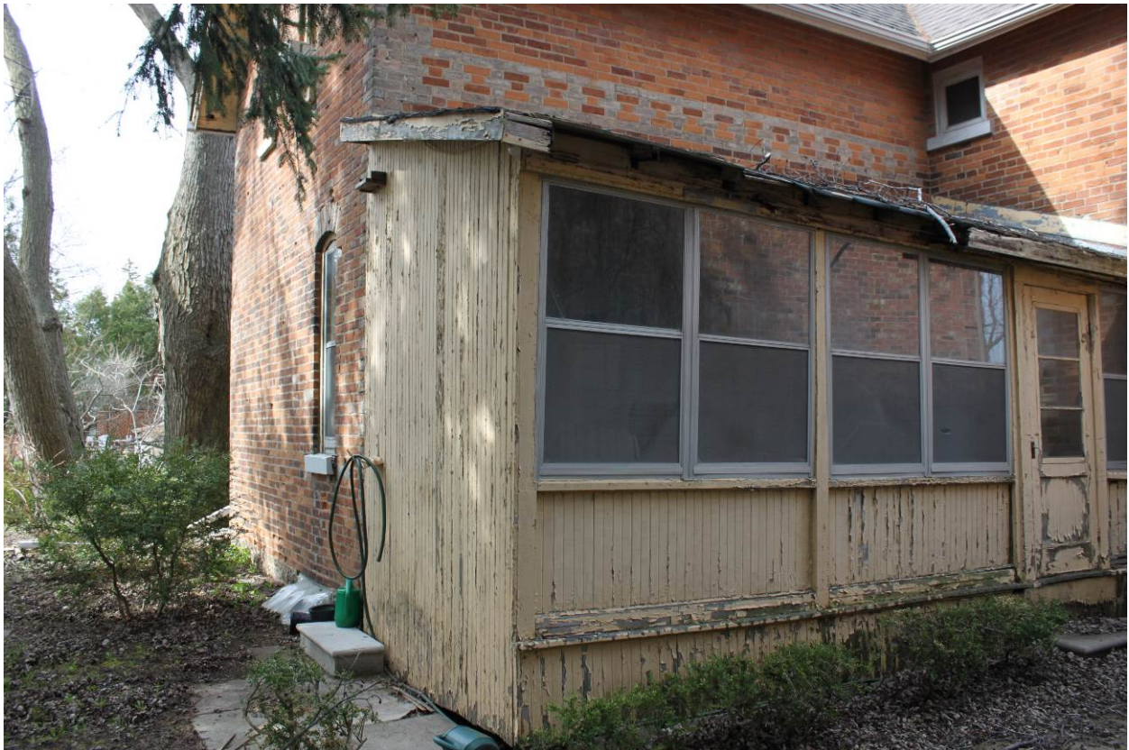
Rear of building and closed porch – proposed location of addition. May 7, 2014