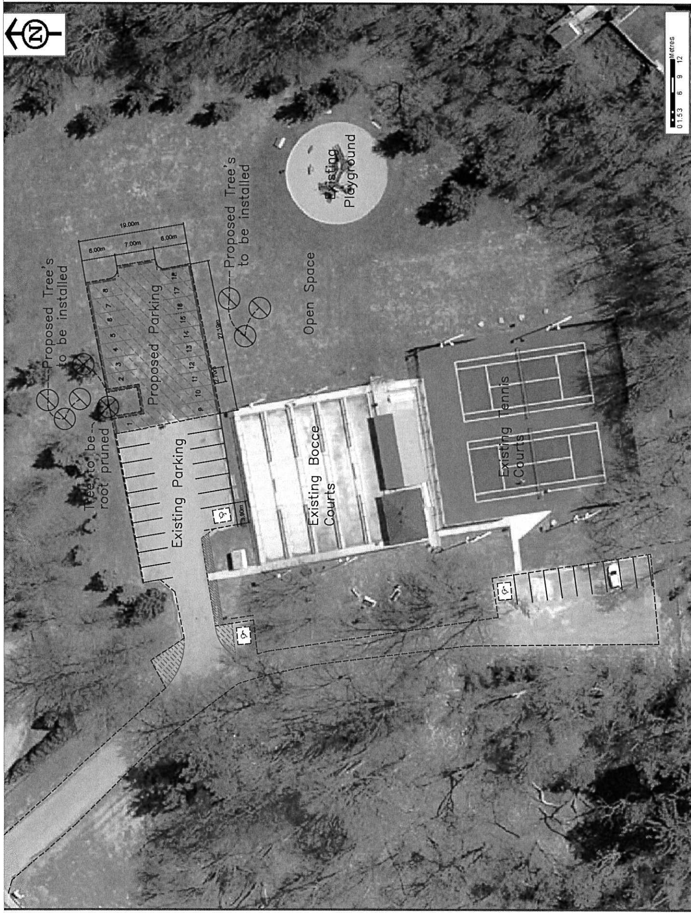
Maxey Park - Attachment 'B' Parking Lot Layout Plan