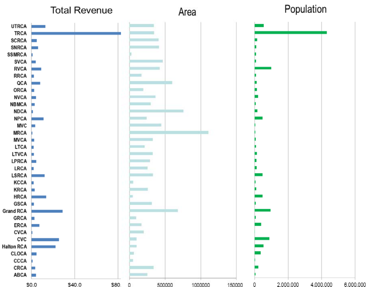
Table 1: Diversity of Conservation Authorities' Revenue, Area and Population 18

Under the Act, conservation authorities are required to have an annual financial audit with the auditor's report provided to participating municipalities and the MNRF. In terms of expenditures, conservation authorities report spending, in total, roughly 43% on water management, 42% of revenue on land management, 12% on administration and 3% on communications. 19 However, expenditures from one conservation authority to another may vary significantly.