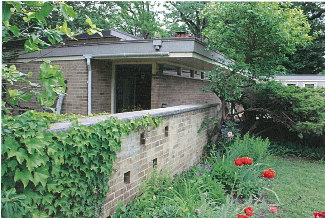
82 Monsheen (photo: staff June 13, 2011)