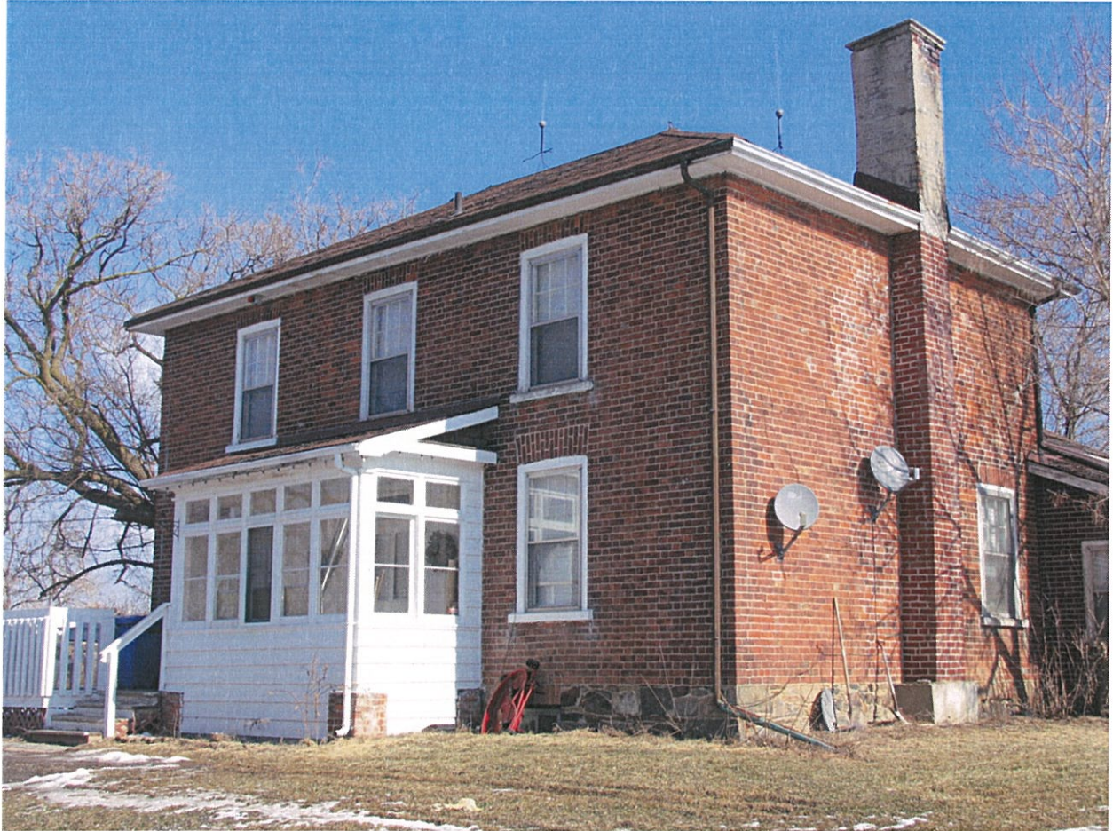
9151 Huntington Road (circa 2006)