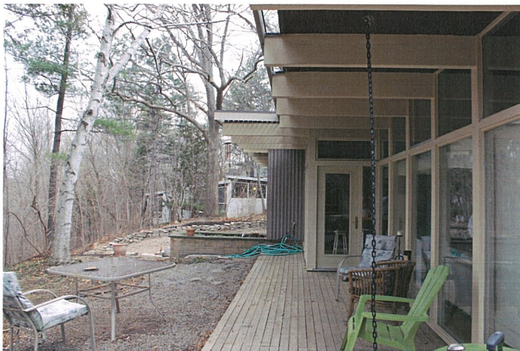
82 Monsheen (photo: staff November 26, 2011)