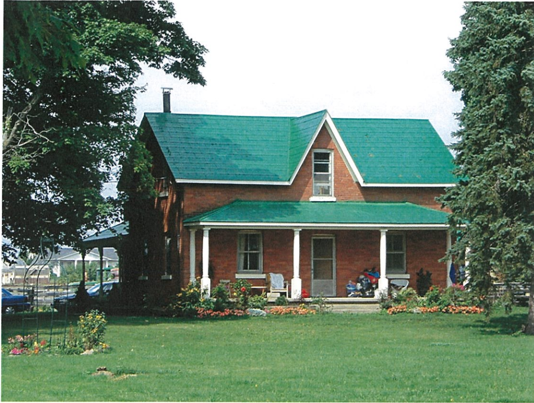
2720 King-Vaughan Road (photo: staff August 29, 2005)