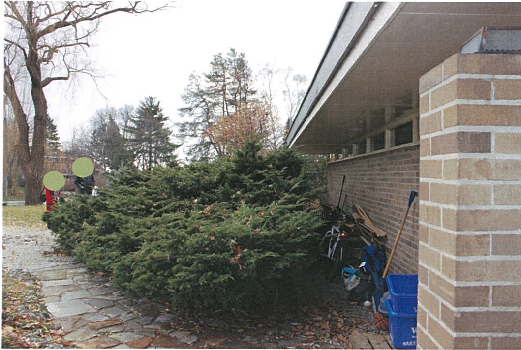
82 Monsheen (photo: staff November 26, 2011)