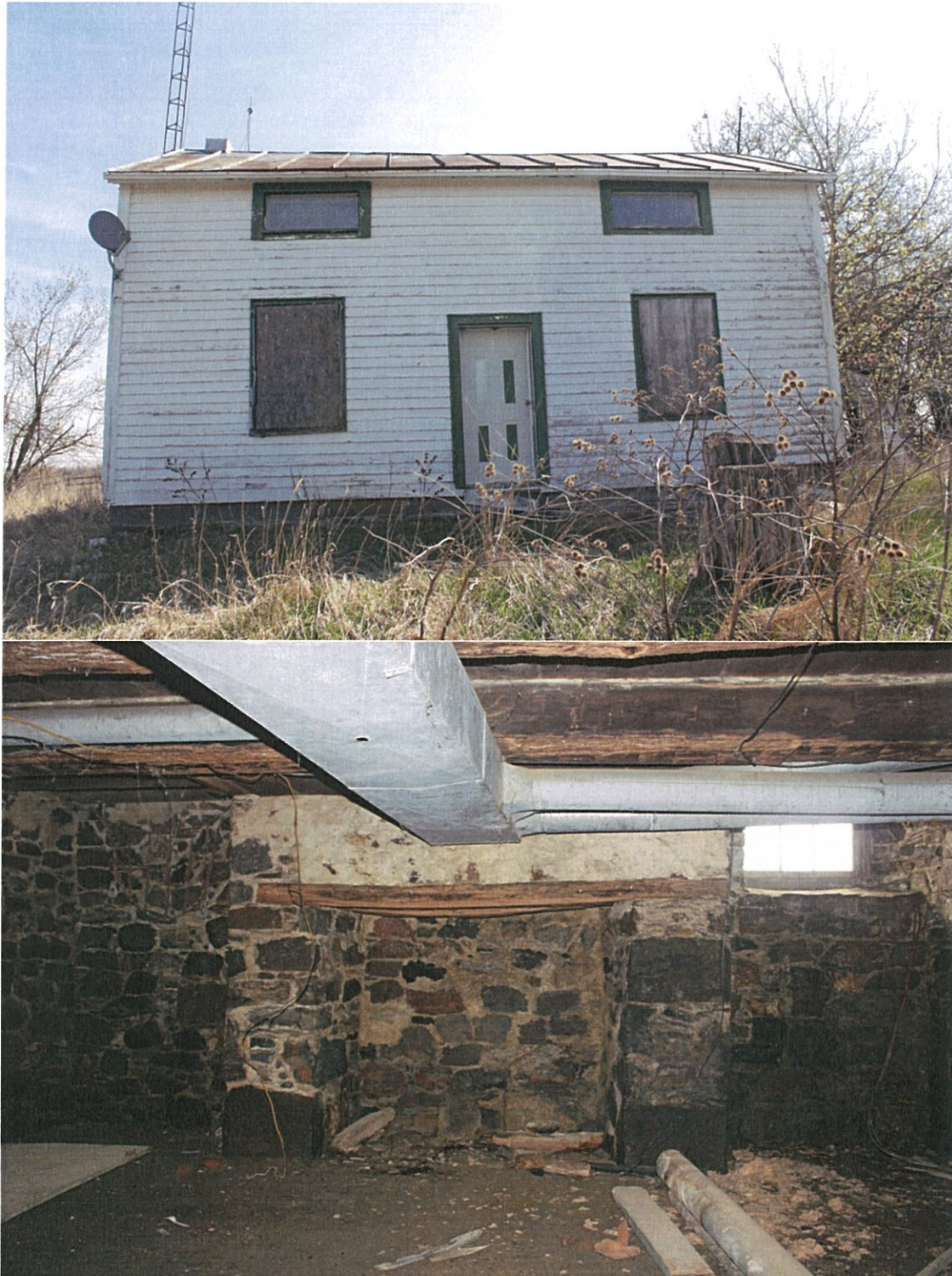
8811 Huntington Road (photos: staff April 30, 2015)