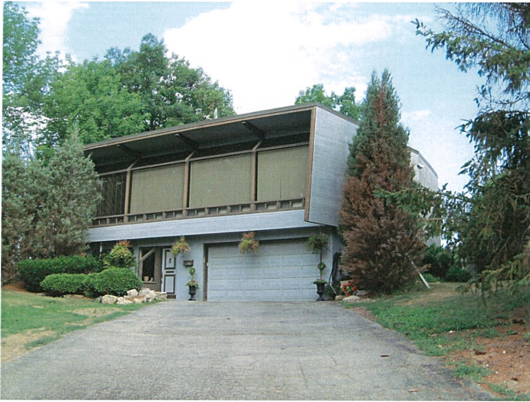
46 Monsheen (photo: staff July 21, 2005)