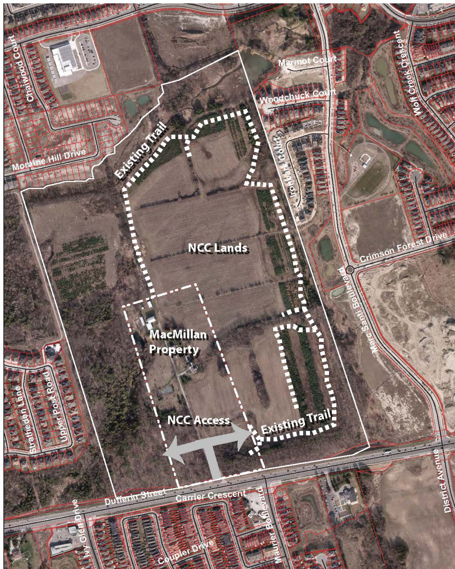
Map of Proposed Occasional Access Area