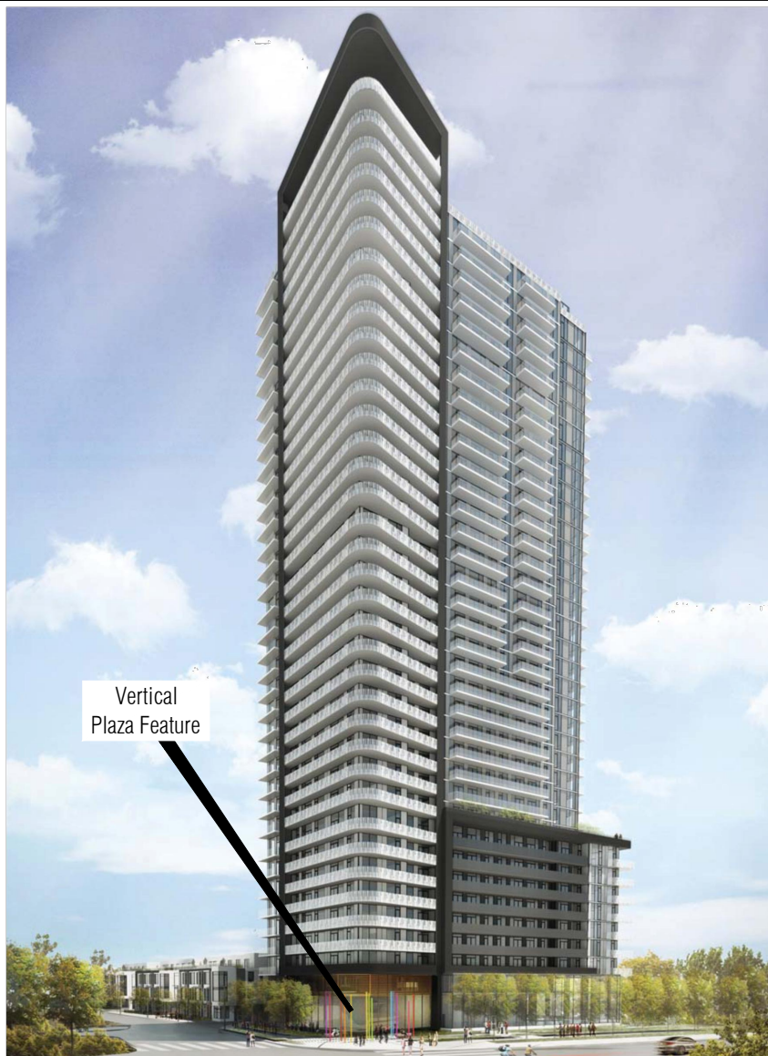
View from Jane Street and Portage Parkway intersection