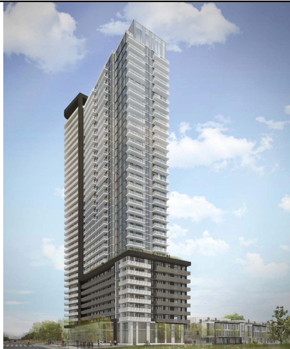
View looking northeast from Jane Street