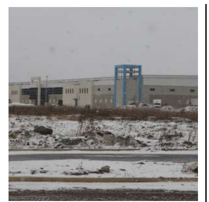
Indoor Soccer Facility