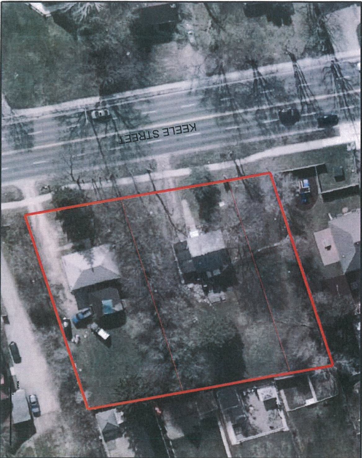
AIR PHOTO 5786, 5787 KEELE STREET & PARCELS KNOWN AS PCLT/6-1 SEC 65/24/07, DISTRICT OF CUMBERLAND CITY OF VAUGHAN

WESTON CONSULTING planning + urban design