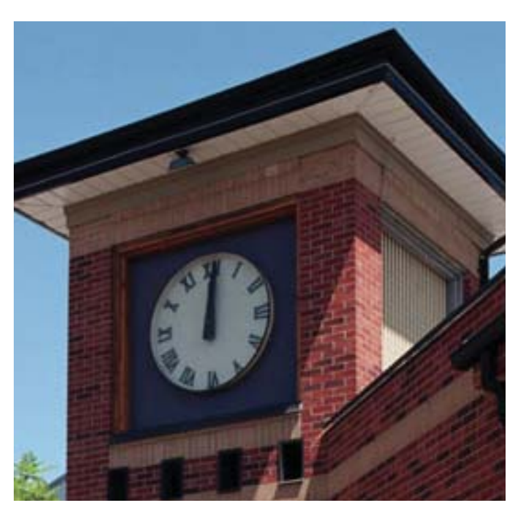
Vaughan's strategic plan identifies as a strategic objective:

preserving our heritage & support diversity, arts & culture.