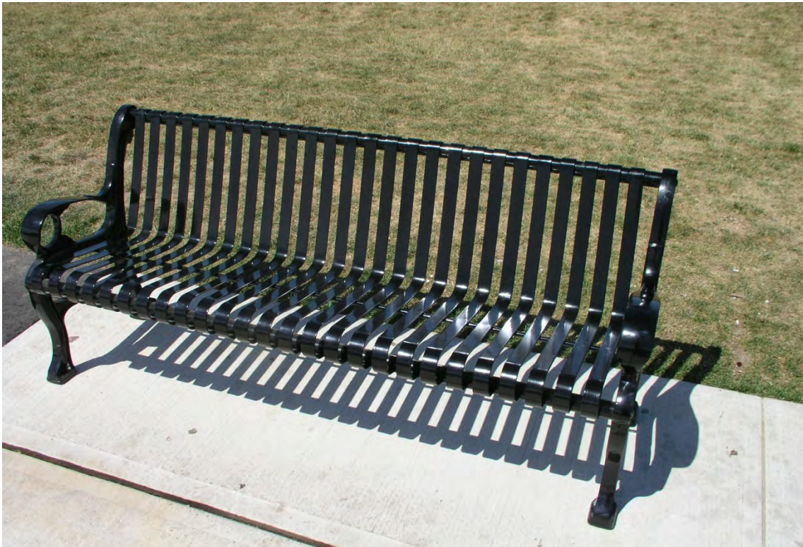
Standard City of Vaughan Park Bench