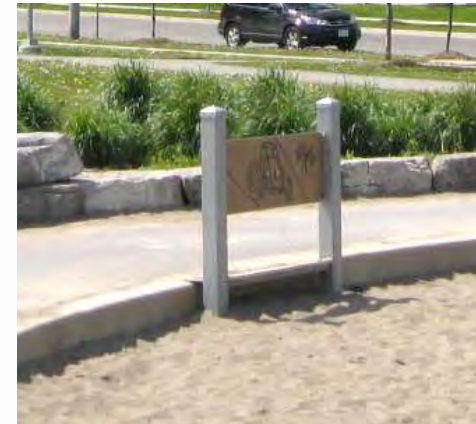
Thornhill Green Park