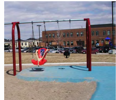
Via Verde Park