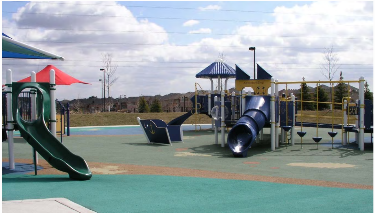
Sonoma Heights District Park