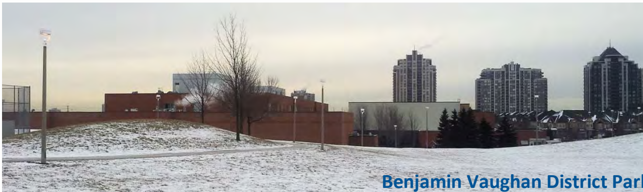
Benjamin Vaughan District Park