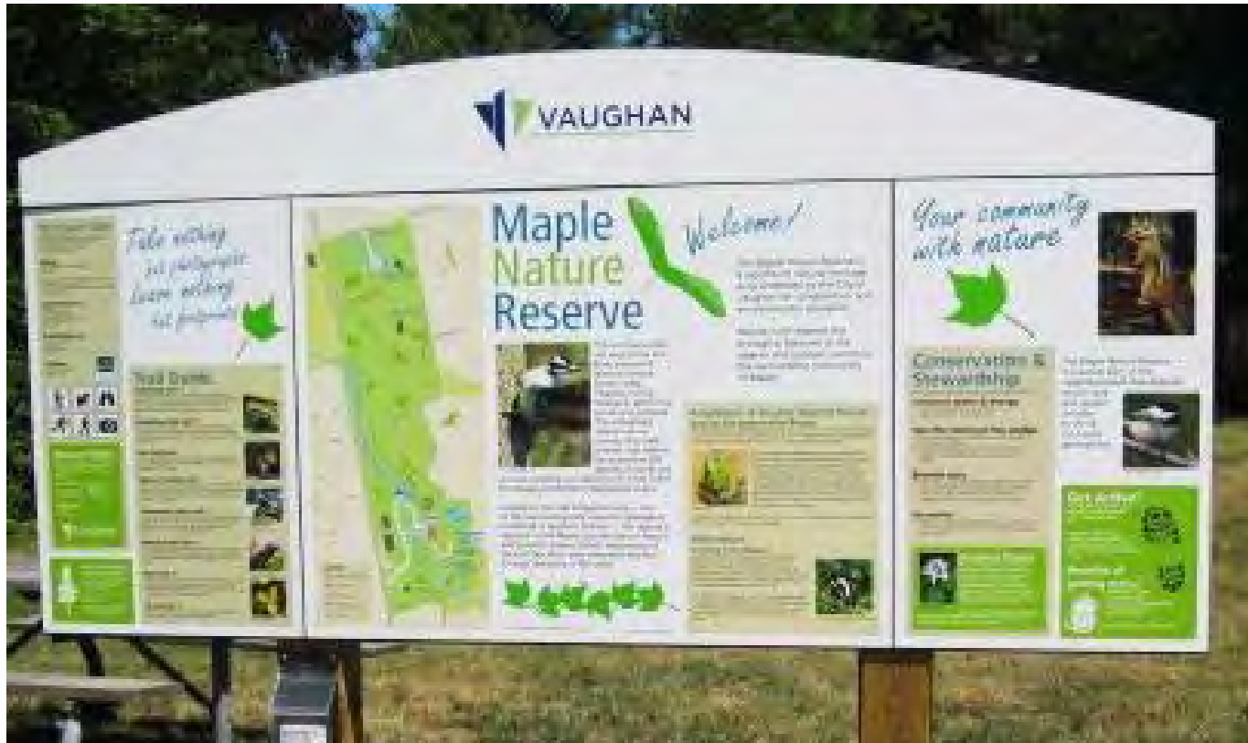
Maple Nature Reserve