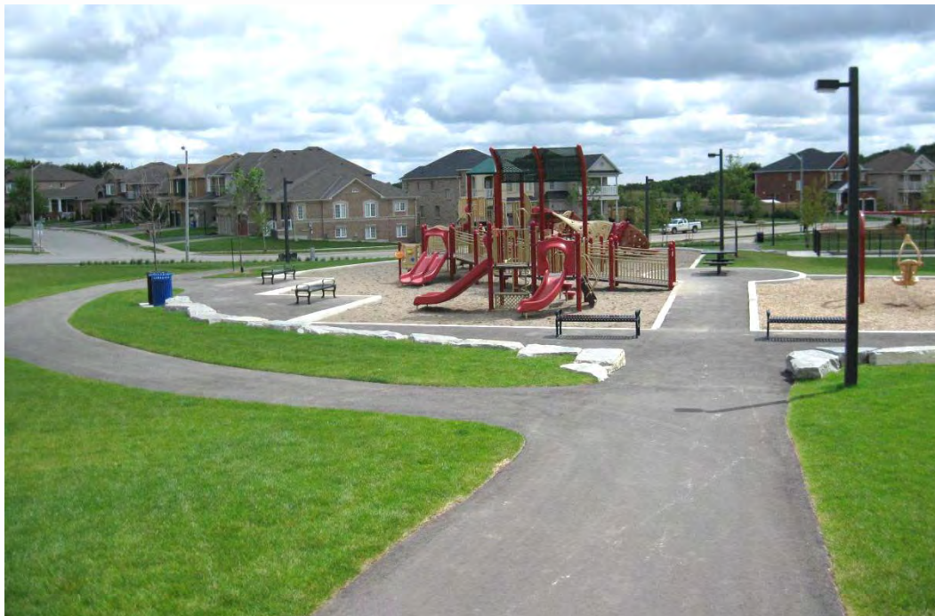
Peak Point Park