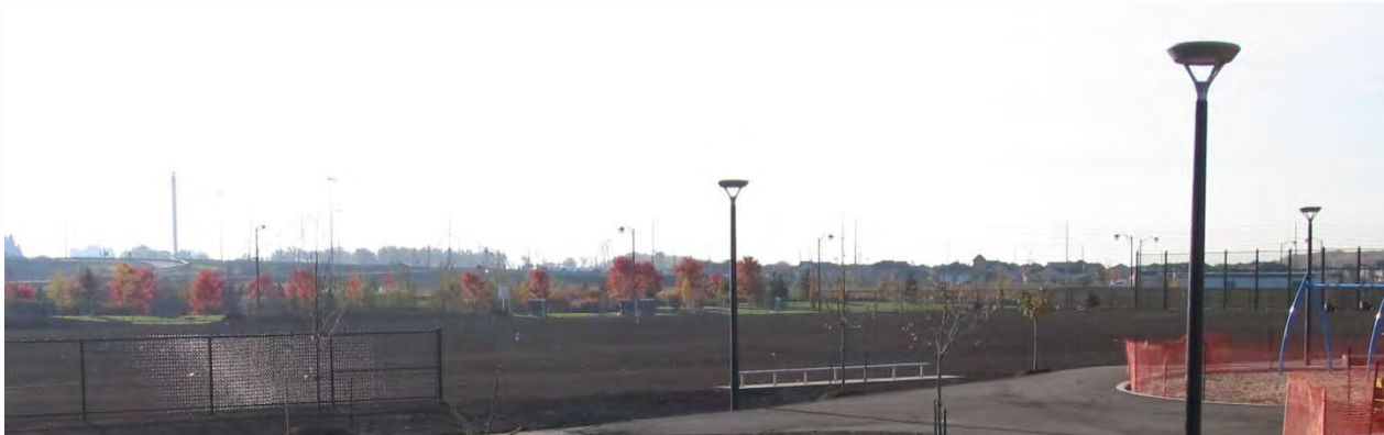
West Wind Park