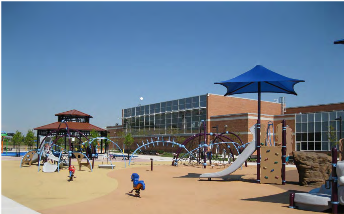
North Thornhill Regional Park