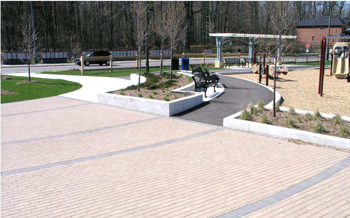
Via Campanile Park