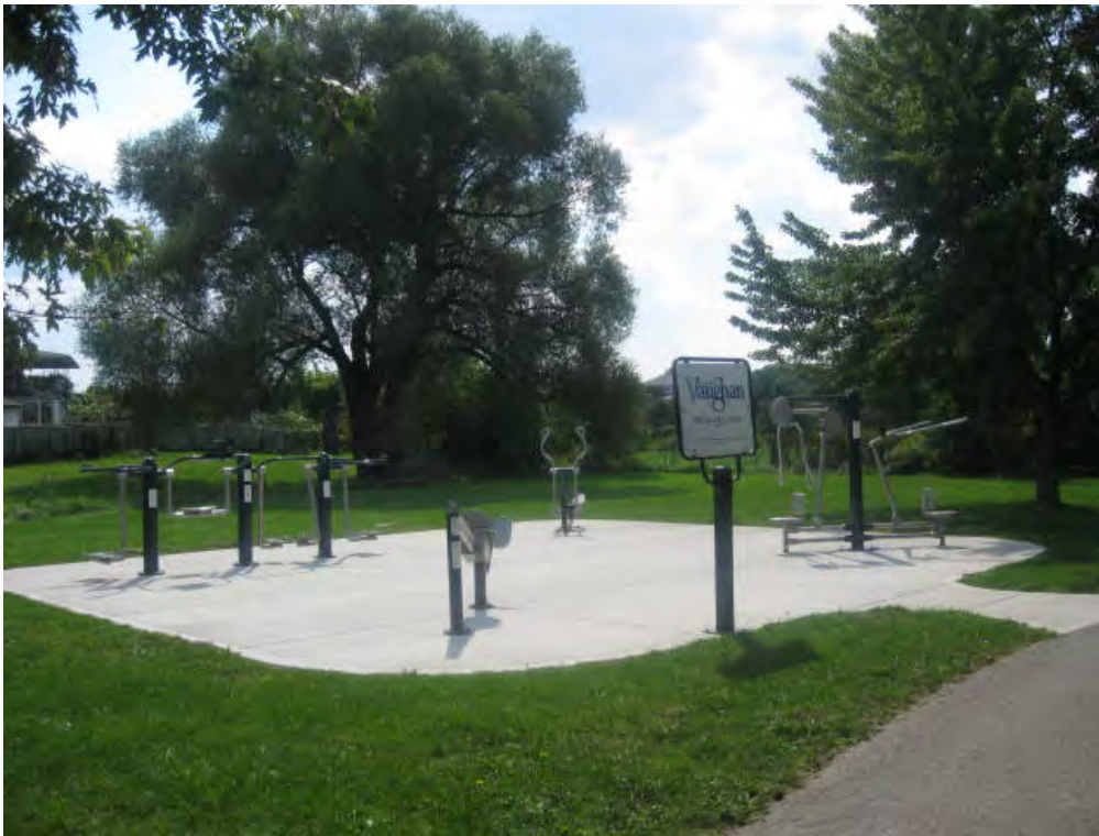
Jersey Creek Park