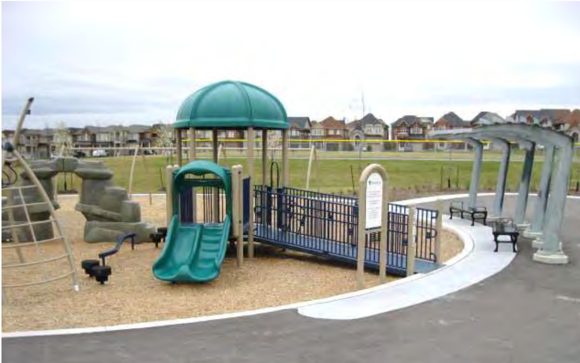
Eagles Landing Park