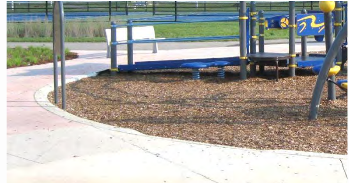
Twelve Oaks Park