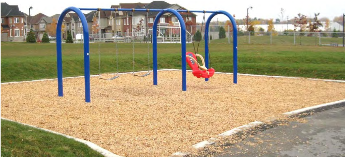
OHR Menachem Park