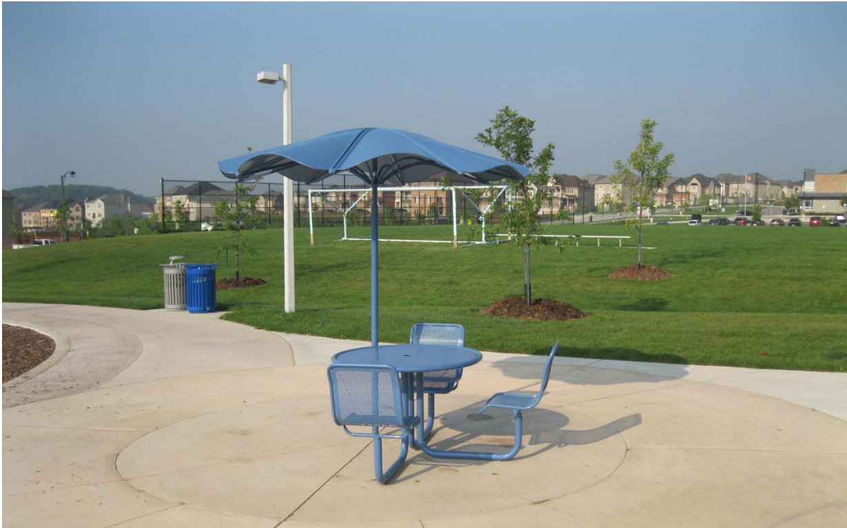
Carousel Table and Umbrella – Twelve Oaks Park