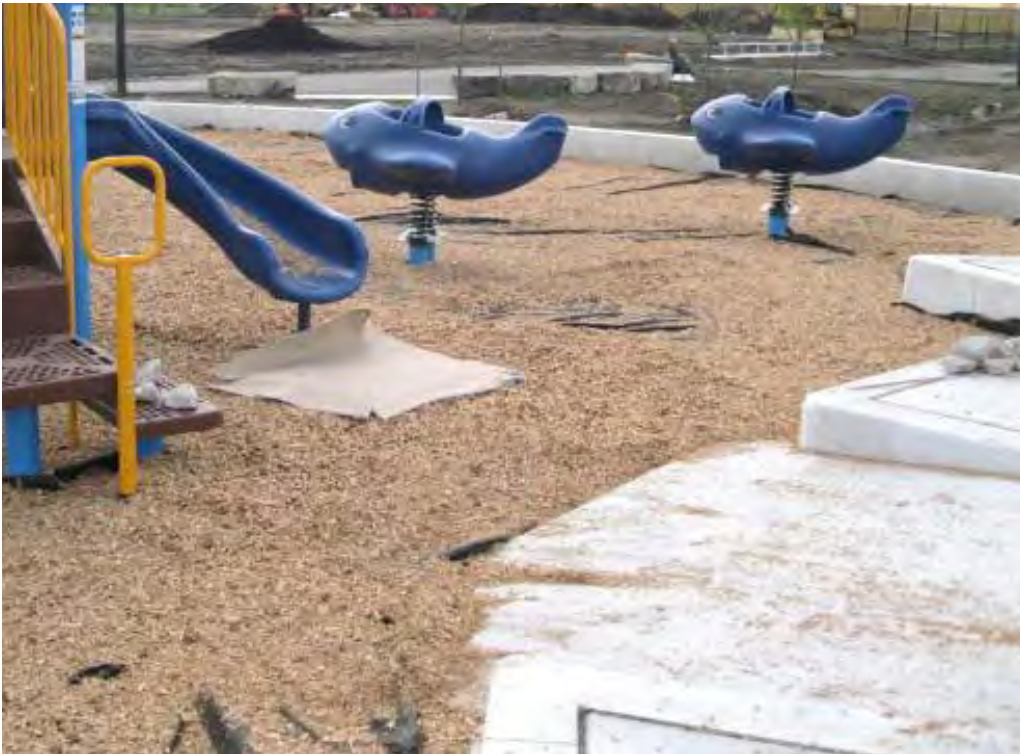
West Wind Park (in Construction)