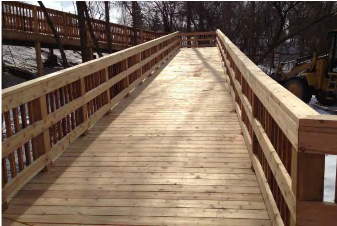
Bartley Smith Greenway