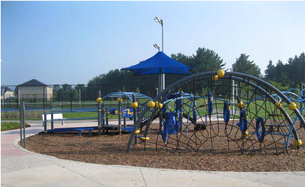
Twelve Oaks Park

SAFETY SURFACING: -wood carpet engineered mulch