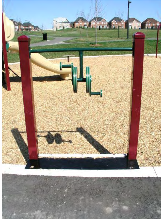
Via Campanile Park