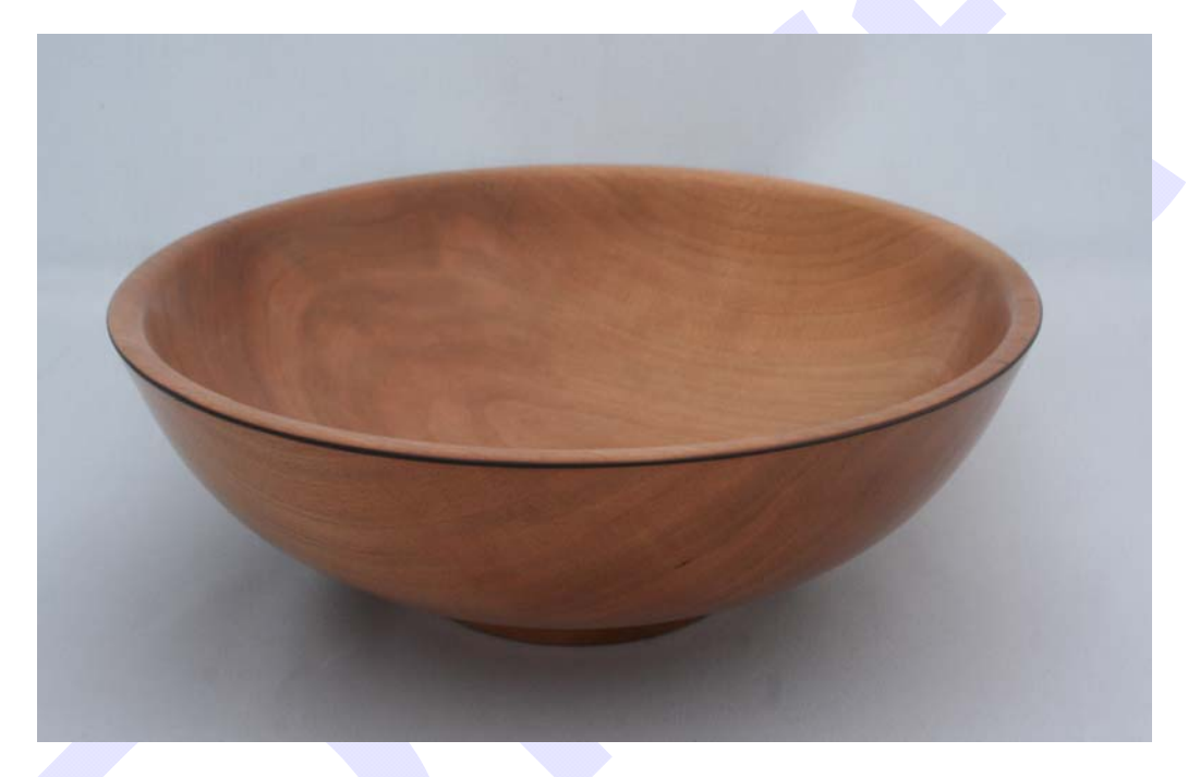
Bowl by Shawn Hermans, Vaughan of a Kind

Artwork projects are determined, in part, by 'One Percent for Art' funding sources. Some funds are restricted to a new construction site or influenced by specific departmental goals and objectives. However, money placed in the Municipal Art Fund may be combined into projects that include funding from several sources. This enables the City to create special projects and citywide programs that have a greater impact than small-scale artworks peppered around the city. http://www.seattle.gov/arts/publicart/municipal art plan.asp