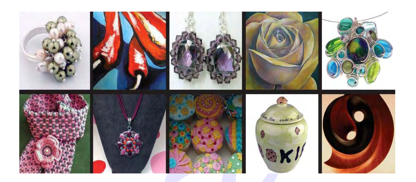
Vaughan of A Kind 2009

Screenings – most recent new media on the big screen and exclusive first time screenings.