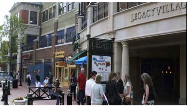
Legacy Village, Lyndhurst, Ohio

As an alternative to the power centre, which has been criticized for not adapting to non-automobile trips and lacking the aesthetic form and appeal required to attract the upscale market, some development companies are turning to so-called "lifestyle centres" and other hybrids.