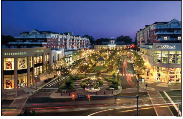
The Marketplace, Arlington, Virginia

Historically, village or town centers included uses such as markets, shops, civic buildings, offices, hotels and gathering spaces where the 'mixeduse' concept was a given. The interplay between these uses created an exciting and active place for the community to gather at all times of the day. These historic centres have the benefit of an established mix of uses. Developing an appropriate mix in a new centre or trying to introduce new uses