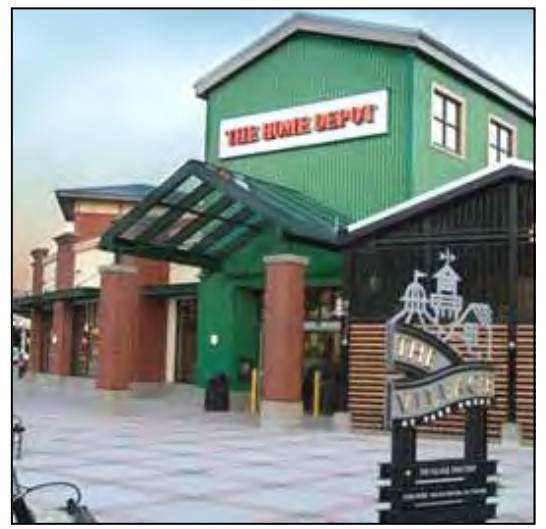
Park Royal Shopping Centre, North Vancouver

draw. Currently, lifestyle centres are mainly developed in the United States and can have both interior and exterior components. In Canada, the first "lifestyle centre" was developed as part of Park Royal Shopping Centre in North Vancouver. Many of these centres focus on high fashion and include upscale retailers such as Pottery Barn, Williams Sonoma, Restoration Hardware, Ann Taylor, etc. The Shops at Don Mills recently opened in Toronto at Don Mills Road and Lawrence Avenue on the site