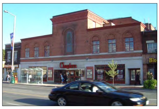
Bloor West Village, Toronto

Opportunities to re-establish retailing along neighbourhood commercial streets will likely increase in the future, as urban lifestyles are becoming more popular among empty nesters, and increasing numbers of seniors and immigrants. Municipalities across North America are adopting policies to redirect growth back into existing communities through investment incentives and innovative planning