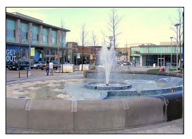
Shops at Don Mills, Toronto

Northtown Plaza in North York with high density residential and ground floor retail are examples of this trend in proximity to Vaughan.