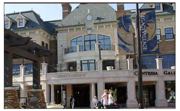
Legacy Village, Lyndhurst, Ohio

Lifestyle centres are aiming to strike a balance between the mall shopping experience and the need for big box specialty tenants to create a regional