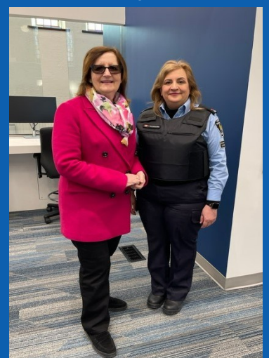
York Regional Police Substation opening