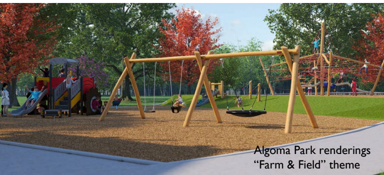
Algoma Park renderings “Farm & Field” theme

Nashville Park (639 Barons St) will include a shade structure, junior/senior playgrounds, double tennis court with pickleball line overlay, pathway lighting, multi-use lawn, native meadow and tree plantings forming an urban canopy walk.