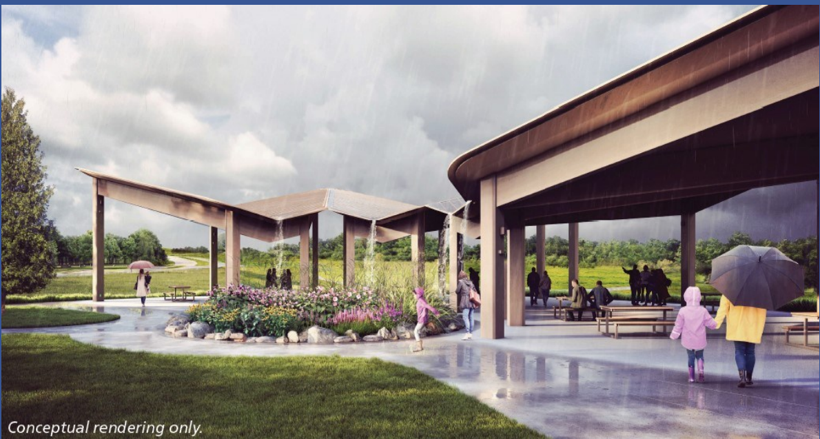
Conceptual rendering only.

The Family Recreation Area at North Maple Regional Park will span over 15 acres and will feature a nature playground, waterplay, a winter skate trail, a pondside boardwalk, accessible pathways, a large picnic canopy, flower gardens, and a pavilion with washrooms. Construction is underway and opening is planned for 2026 for all to enjoy!