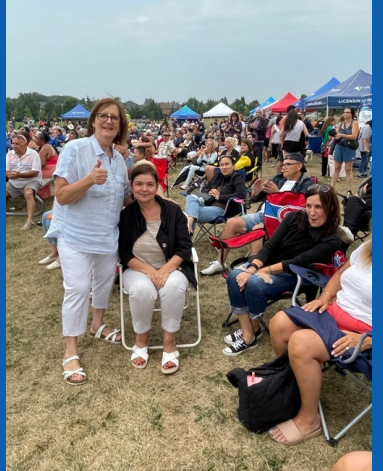
Concerts in the Park