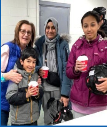
Annual Family Day Skate