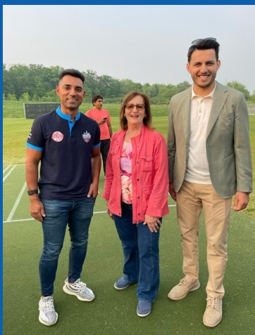
Official Opening of Cricket Field at NMRP