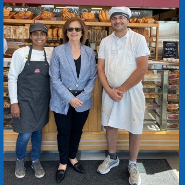
Cobs Bread now in Kleinburg