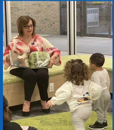
Storytime at Maple Library