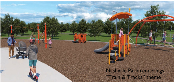
Nashville Park renderings “Train & Tracks” theme