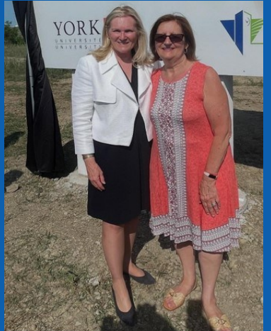
York University School of Medicine sign unveiling