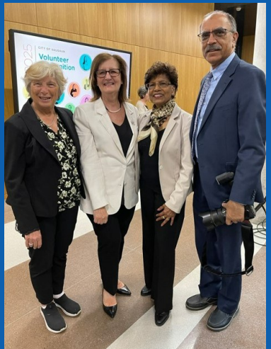
Volunteer Recognition Awards