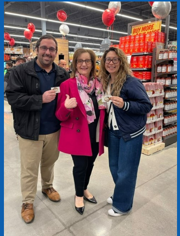
Longo's Kleinburg Opening