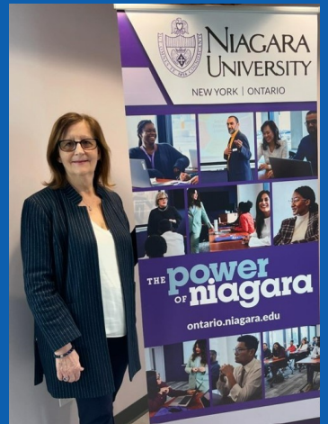
Opening of Niagara University's new campus