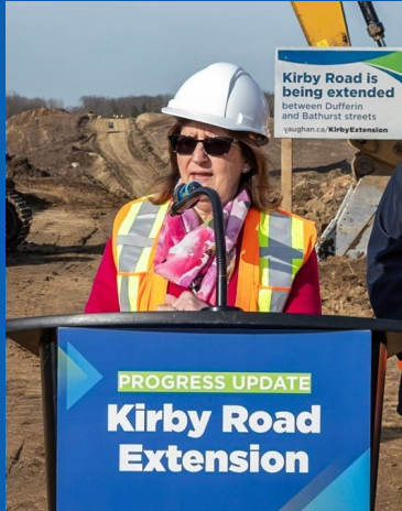
Kirby Road Extension