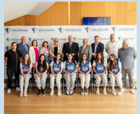
Woodbridge Lions U16 girls basketball team