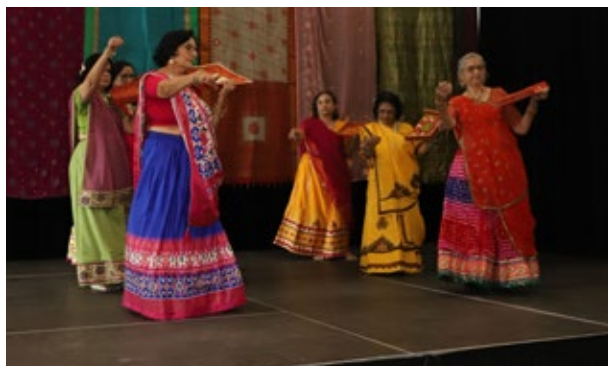
South Asian Heritage Month event

To learn about more cultural and faith-based observances and festive events taking place throughout the year, visit vaughan.ca/events .