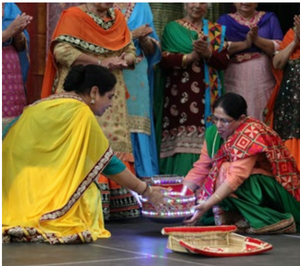
South Asian Heritage Month event