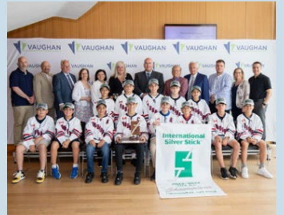
Vaughan Rangers U12 hockey team