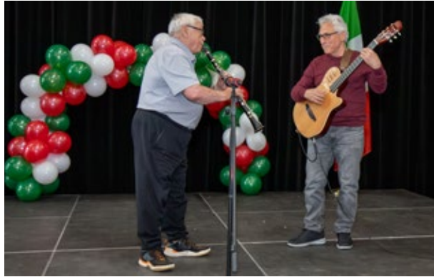
Italian Heritage Month event

These events are just a few examples of the work the City is doing to honour our diversity and showcase the many cultures that make up our beautiful city.