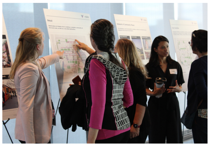
Figure 2: City staff and consultant team discussing the preferred option with community members.