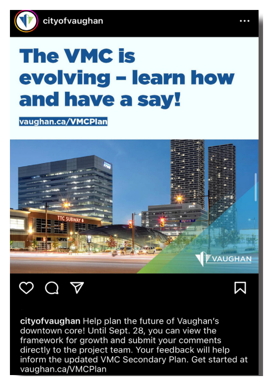
Figure 5: Instagram post