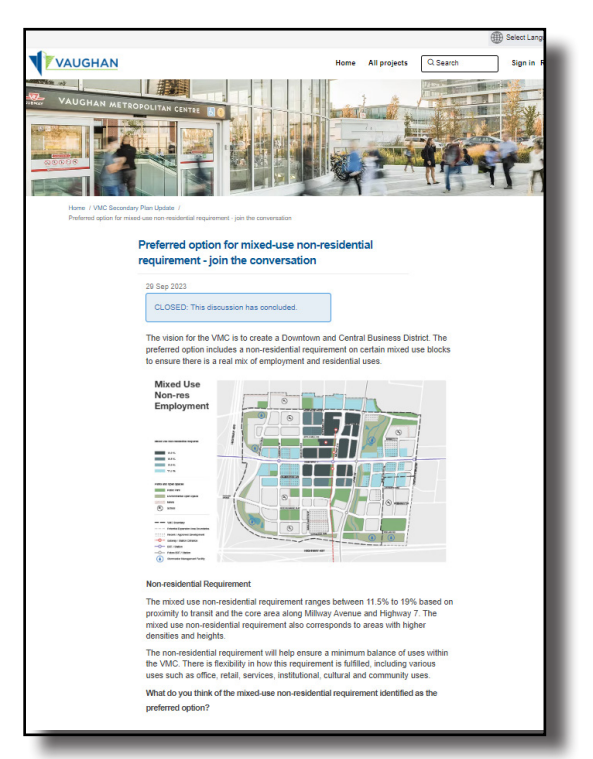
Figure 4: Forum discussion board

Comment forms were also available digitally between September 14 and September 27, 2023. 8 community members completed forms. After the in-person open house on September 14, 2023, the information boards and presentation were available online.