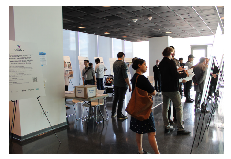
Figure 1: Community members viewing the information boards at the open house held at the David Braley Vaughan Metropolitan Centre of Community.

Paper comment forms were available during the open house and 3 community members completed forms. People were asked to submit feedback, comments, and questions about land use, density, retail, and civic facilities identified in the preferred option.