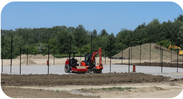
Example of a site in Vaughan undergoing alteration in preparation for development