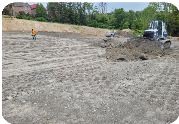
Example of a site in Vaughan undergoing alteration in preparation for development

There are three ways to share your feedback