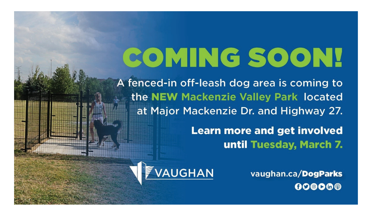
Figure 2. Advertisement featured on televisions in community centres