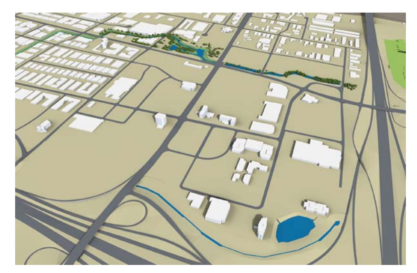
EXISTING CONDITIONS IN THE VMC - VIEW LOOKING NORTHEAST.

The purpose of the digitally modeled concepts shown here is to illustrate the potential for growth in the VMC and the variety of development types and forms the Secondary Plan can accommodate.