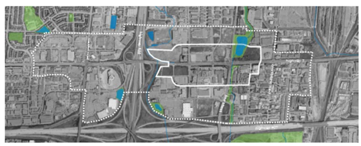
AERIAL OF THE STUDY AREA - VCC DISTRICT [ - - - ] VCC NODE [-----]

The first phase of the study concluded that the lands west of Highway 400 within the former Vaughan Corporate Centre should be addressed by Volume 1 of the Official Plan and be subject to a future Secondary Plan. The study team also recommended that the bulk of the active industrial uses east of Jane Street, along and south of Highway 7, within the VCC, remain an Employment Area and also be addressed by Volume 1. The area between these two areas is considered to have the greatest potential for change over the next 20-25 years and contains sufficient land to achieve the City's overarching objective for the area - to develop a "downtown".