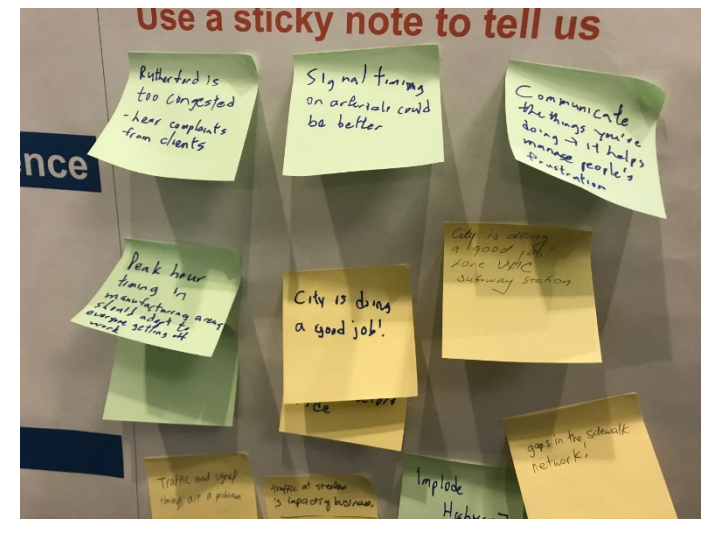
Figure 9 – Photo of ideas and concerns noted on post-it notes and placed on the display