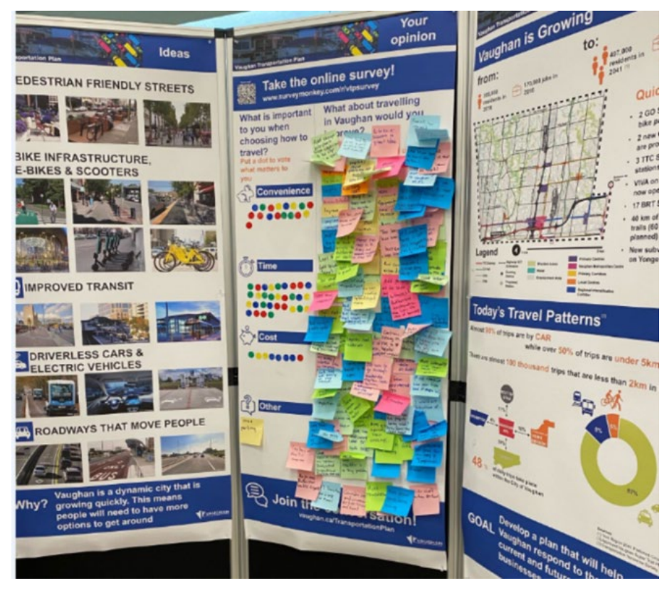
Figure 3 – Photo of ideas and concerns noted on post-it notes

The project team recorded 187 individual ideas which were written on post-it notes and placed on the display. These are shown at Figure 3 .