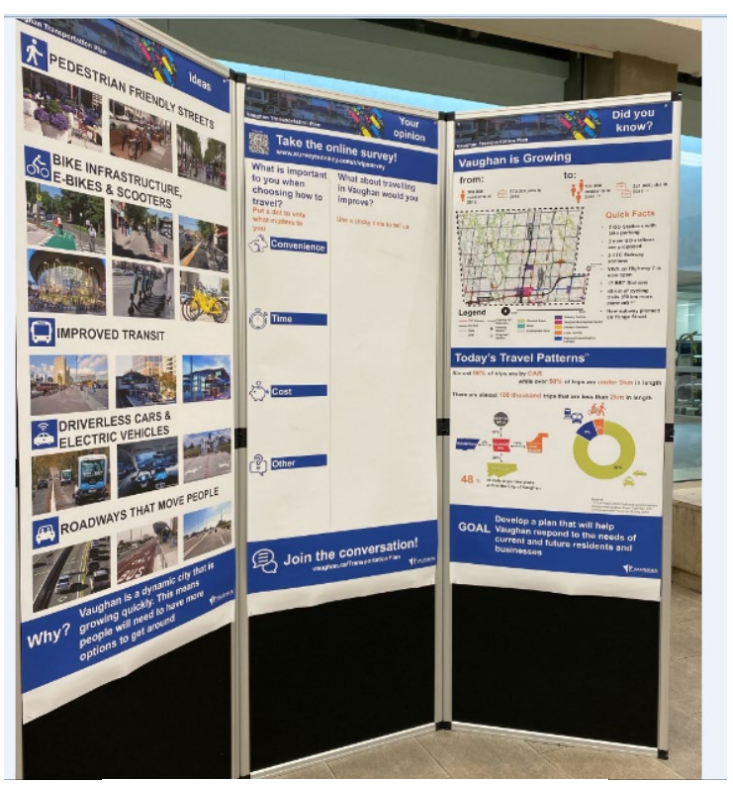
Figure 1 – Pop-up Kiosk Display

At the 2020 Vaughan Business Expo on February 11, from 8:00 a.m. to 3:00 p.m. at the Terrace Banquet Centre.