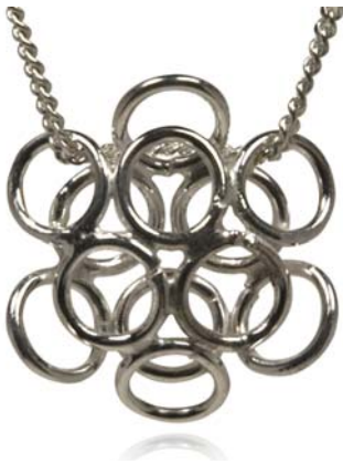
NECKLACE: Chakman Chow