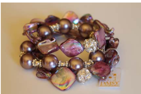
BRACELET: Rita Giancola ( Daisy Beaded Creations )