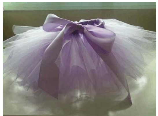
TUTU: Sally Bournas-Vrantsis ( Love Zoe, Little Girl Luxury )