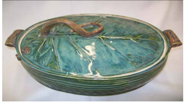
DISH: Traci Tomkin ( Throwing a Fit Pottery Studio )