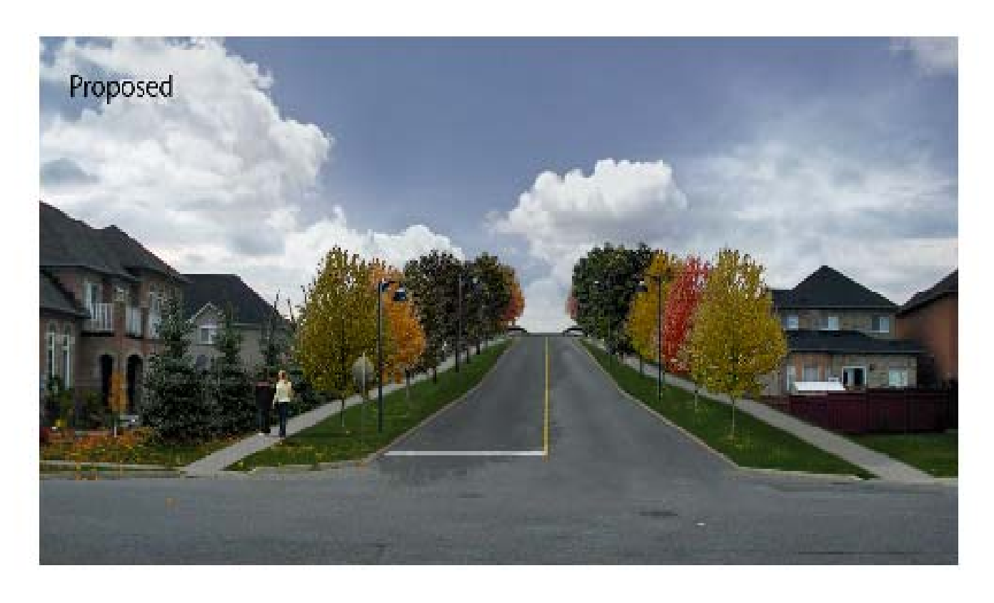
NORTH MAPLE COMMUNITY BRIDGE