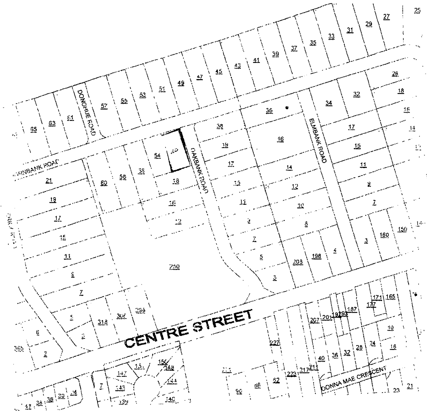
Map showing location of properties covered by signatures on the Petition