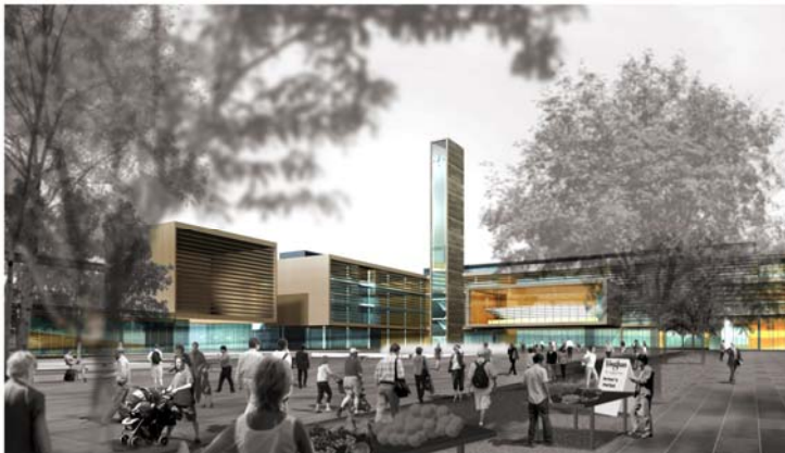
Vaughan's new Civic Centre is slated for Gold LEED certification

A partial list of current initiatives at the City of Vaughan, current as of April 2009