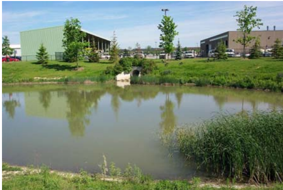
Stormwater management pond at Vaughan's Joint Operations Centre, 2800 Rutherford Road.

A partial list of current initiatives at the City of Vaughan, current as of April 2009