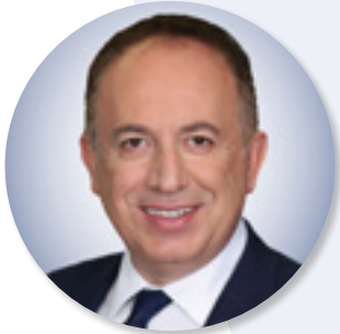
Hon. Maurizio Bevilacqua, P.C. Mayor of Vaughan

maurizio.bevilacqua@vaughan.ca 905-832-2281 ext. 8888 vaughan.ca/ Mayor