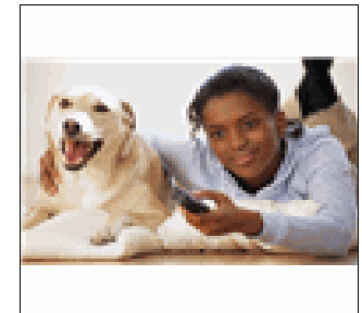
Picture of Pet

Feeding/ Special Instructions: _____ _____ _____